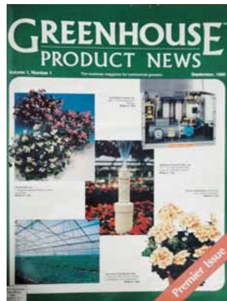
What will happen in the next 20 years remains to be seen...

847.391.1019 thodson@sgcmail.com www.facebook.com/thodson1 www.twitter.com/gpnmag