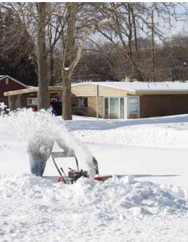
A distant memory from Winter 2011

(847) 391-1019 thodson@sgcmail.com www.facebook.com/thodson/ www.twitter.com/gpnmag