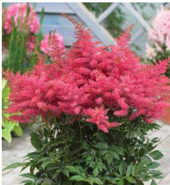
'Younique Cerise'