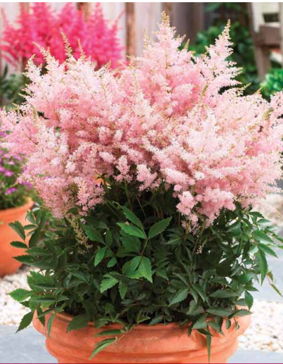
'Younique Silvery Pink'

Maintain the media throughout the production cycle with a pH between 5.8 and 6.3. Astilbe require light to moderate amounts of nutrients. Leaf scorch is likely