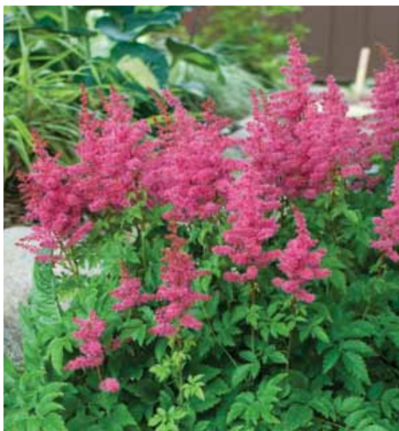
'Younique Carmine'