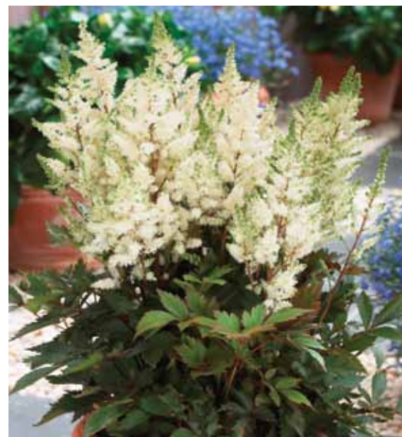
'Younique White'