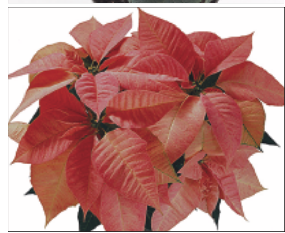
Top to bottom: 'Twister' (Dummen); 'Winterfest Coral' (Oglevee); 'Winter Rose Early Red' (Ecke); 'Merry Christmas 2' (Selecta First Class).