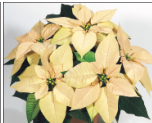
Left to right: 'Winterfest Jingle' (Oglevee); 'Premium Marble' (Dummen); 'Limelight' (Dummen); 'Premium Apricot' (Dummen).