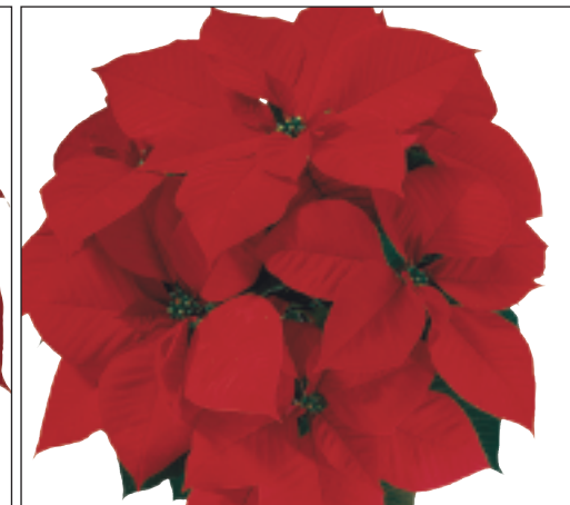
Left to right: 'Autumn Red' ( Ecke ); 'Cortez Electric Fire' ( Fischer ); 'Christmas Poem' ( Selecta First Class ); 'Christmas Spirit 2' ( Selecta First Class ).