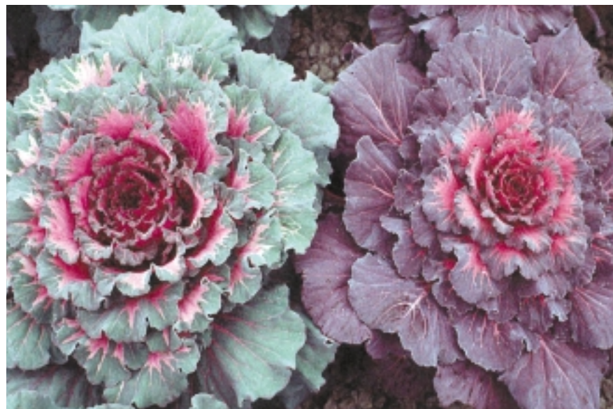
Although 'Osaka Red' plants treated with clear water (r) produced more intensely colored foliage than the constant liquid fertilized plants (l), center color diameters were similar, and the clear water treated plants produced more chlorotic leaves.

Two weeks after treatments were initiated, electrical conductivity readings were below the recommended PourThru EC values of 1.0 mS per cm. for ornamental cabbage for all treatments providing tap water. The tap water-irrigated plants had more chlorotic lower leaves (an indication of nitrogen deficiency) than the plants on continuous feed. This difference was more distinct four weeks after initiation of clear water, with the tap water-irrigated plants having eight chlorotic leaves, compared to two chlorotic leaves on the continually fertilized plants. The most significant observation was that the color diameters of all treatments were similar two and four weeks after treatments were initiated. ♦