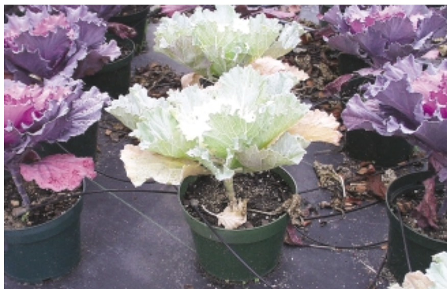
Growers that induce coloration through clear water irrigation also induce nutrient deficiencies.

In 1999, the ornamental cabbage cultivar 'Osaka White' was fertilized with concentrations of nitrogen at 100, 150, 200 or 250 ppm on a continual basis until visible color was observed in the upper-central leaves. Plants were taller when fertilized at 200 or 250 ppm nitrogen than at 100 or 150 ppm, and fertilizing at 100 ppm produced stunted plants that expressed nitrogen deficiency symptoms (foliage upper-surface yellowing and under-surface purpling). Plant diameters were smaller with plants fertilized at 100 and 150 ppm nitrogen. Fertilizing at 150 ppm may be a more