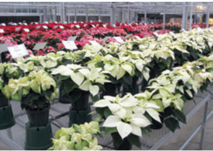
From top: Purdue open house display; consumers evaluateall 95 cultivars at Purdue; poinsettias displayed in the greenhouse.

he National Poinsettia Trials evaluate experimental and new varieties to provide greenhouse growers and breeders with information on how they perform in the northern, central and southern regions of the United States and compare them with older standard varieties. In addition to evaluating poinsettia cultivars, the University of Florida, North Carolina State University, Purdue University and Homewood Nursery opened their doors to the public and asked consumers to evaluate the poinsettias on display.