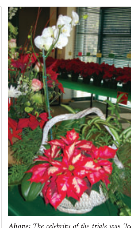
Above: The celebrity of the trials was 'Ice Punch' from Ecke. Below: A proud winner of the consumer raffle shows off his poinsettia spoils.