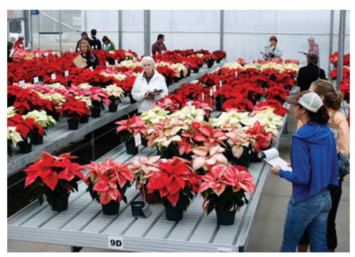
Consumers rate their favorite poinsettias at the University of Florida trials.

'Premium Picasso', Paul Ecke Ranch's 'Ecke 54-06' and 'Polly's Pink', and Syngenta Flowers' 'Carousel Dark Red' and 'Sonora White Glitter'. Ecke's cultivar '54-06' is not yet available to growers but has potential to be a very important jingle-bell type for the South thanks to its upright habit, good branching and stem strength.