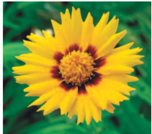
Coreopsis grandiflora 'Sunfire'.

The genus coreopsis offers a diverse mix of perennial and annual species and cultivars that work great in a variety of garden settings. Coreopsis belongs to the asteraceae family, and the daisy-like flowers come in yellow, white, pink and red, some with dark brown, mahogany or maroon centers. The petal forms range from single to fully double, and some even have serrated petal margins, giving flowers a delicate appearance. Many coreopsis cultivars are tolerant to cold, heat, humidity and adverse soil conditions, thus providing extensive choices of plant material to Northern and Southern gardeners. Most coreopsis cultivars are easy to grow in the garden and make an excellent plant choice for even novice gardeners. Coreopsis can be used in the landscape as a specimen or in borders and mass plantings. Some species are also used in mixed containers and hanging baskets.