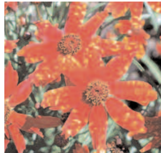
Coreopsis tinctoria 'Tiger'

In our greenhouses, all the 'Sweet Dreams' plants grown at 68^\circ \text{F} developed numerous spots on their leaves and stems. When grown at 79^\circ \text{F} 'Sweet Dreams' did not show these symptoms, and the cause of these symptoms was not identified.