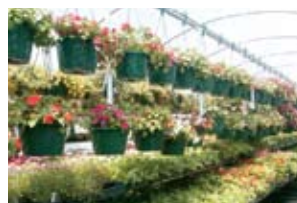
Four runs of purlins display your hanging baskets attractively and within easy reach for customers.