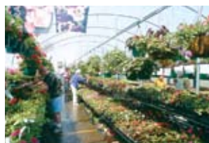
High-capacity, integrated benching provides a cascade of plant color while saving you time and money.