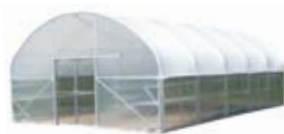
The Garden Mart® features unparalleled strength and Slide-Side natural ventilation.