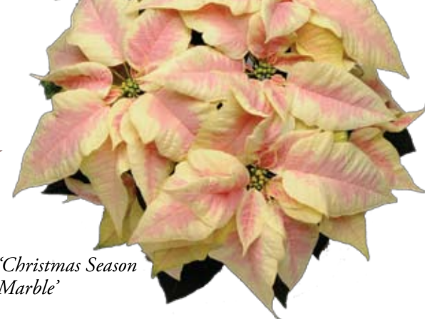
'Christmas Season Marble'