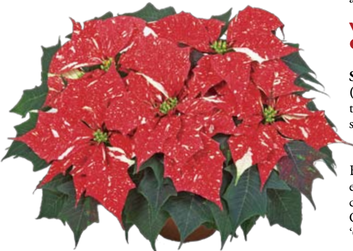
'Sonora White Glitter'

was not as upright as 'Christmas Day'. Flowering was early to mid-season. Plants will work well for small to medium size pots, but have stem strength and vigor for larger pots with adequate weeks of growth, especially in cooler climates.