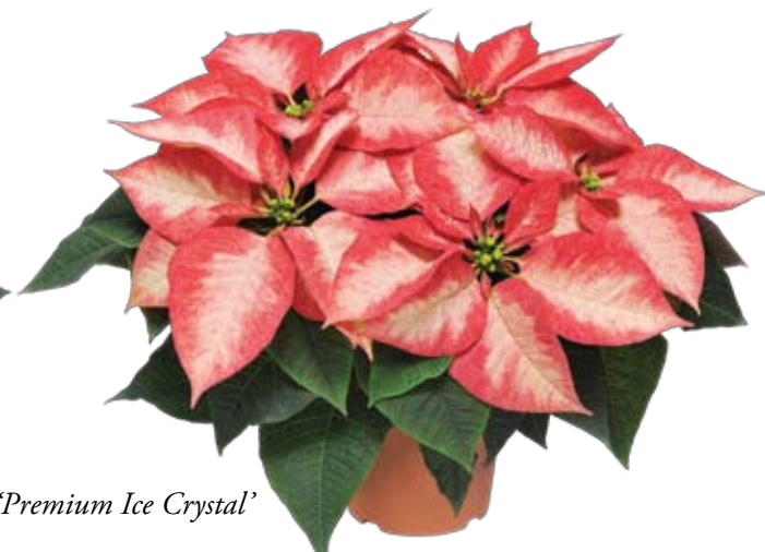
'Premium Ice Crystal'