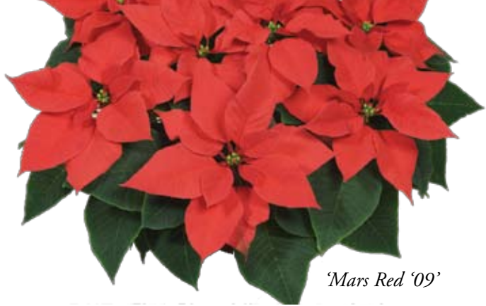
'Mars Red '09'

'Jubilee Red' (Ecke). The important feature of 'Jubilee Red' was that plants flowered exactly between 'Prestige Early Red' and 'Prestige Red' at NCSU — as intended. In UF studies, 'Jubilee Red' has shown to be potentially important in the warmest production areas as a replacement for 'Freedom Red' because it has stronger stems and does not stretch as much. Also, in hot, "heat delay" conditions, 'Jubilee Red' flowers with Freedom and is not delayed like Prestige Early. Compared to 'Freedom Red' bracts are slightly smaller have a medium-red color. The younger bracts tend to lay flat while the older bracts hang down, producing the ball of red effect. Plants have medium vigor with uniform branching and shoot growth. In post-production, 'Jubilee Red' is similar to Freedom and may show physical rubbing injury ("bruising") and youngest bracts can fade if plants are shipped too early. 'Jubilee Red' should work well in a variety of container sizes.