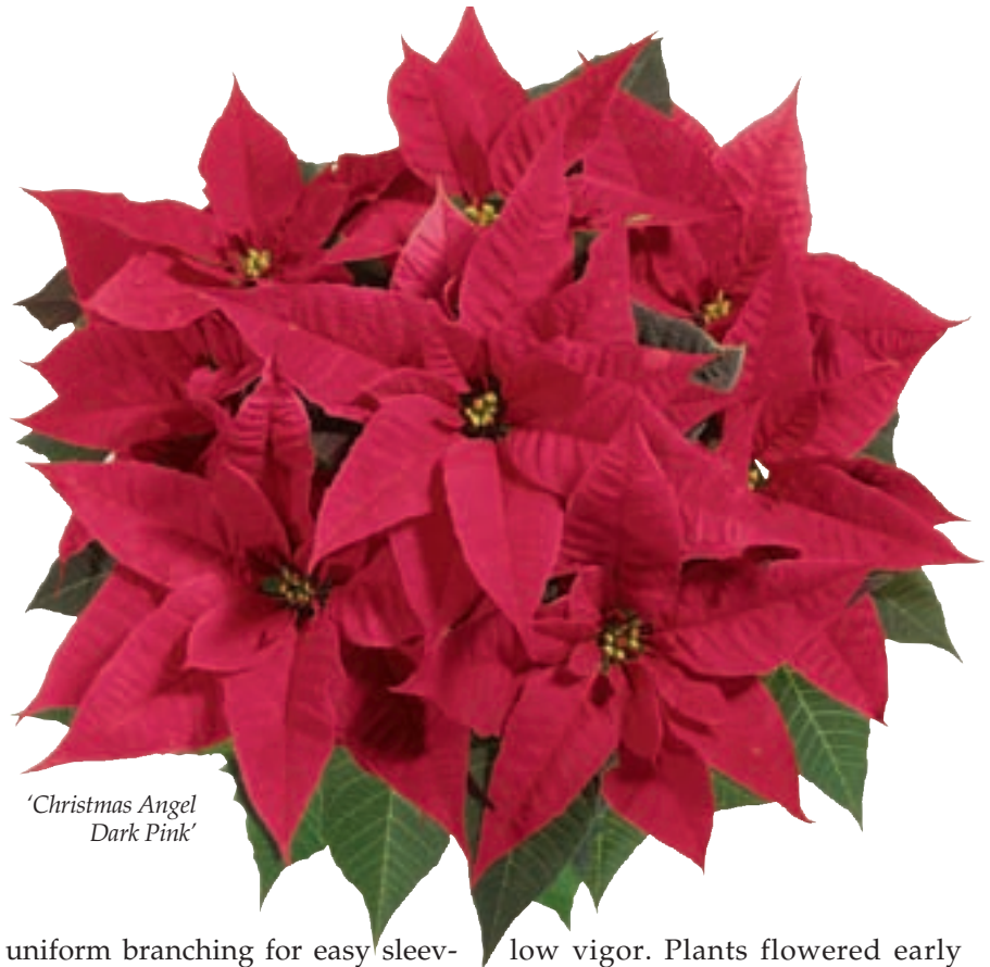
'Christmas Angel Dark Pink'

'Infinity White' (Dümmen). This cultivar has small, rounded, creamy-white bracts that are held upright. The young bracts have a greenish cast, and the overall appearance of the bracts is more greenish than most other white cultivars. The plants are sturdy with