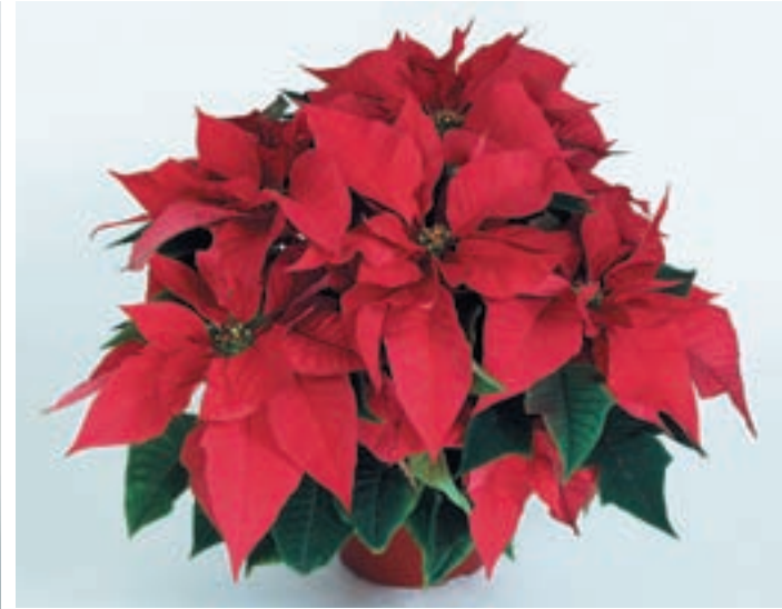
Right: 'Eggnog'. Above: 'Classic Red'.

upright bracts are elongated and a bit narrow, such that a fair amount of green shows through. In warm climates, the first bracts have a slightly pale red color, and the true orange color shows with subsequent bract development. The foliage is dark green, and plants are low to moderate vigor.