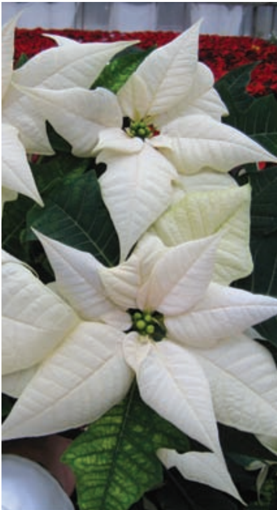
Top: 'Early White'. Bottom: 'Mars Fire'.