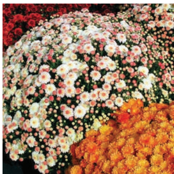
Chrysanthemum 'Cool Cheryl'

'Jolly Cheryl', a rich red; 'Cool Cheryl', a white 2-tone; and 'Sparkling Cheryl', a clear yellow, are new additions to Yoder's chrysanthemum Prophets collection. These new colors are derived from the 2-tone lavender variety 'Cheryl'.