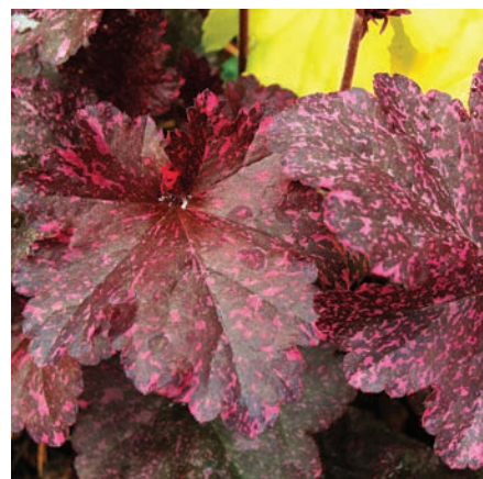
Heuchera 'Midnight Rose'

• A 12-week vernalization period is recommended for optimum flowering.