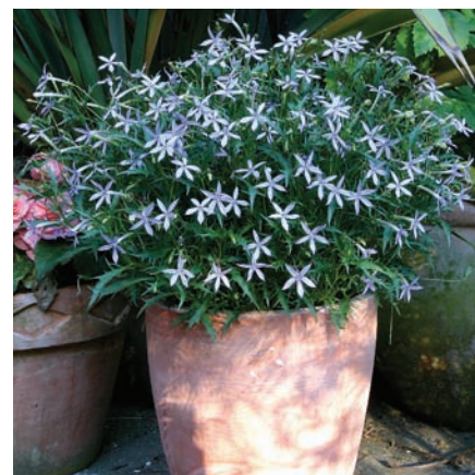
Laurentia 'Avant-garde Blue'