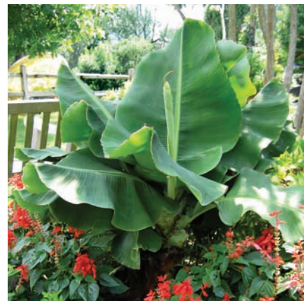
Musa 'Little Prince'