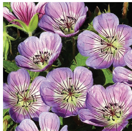
Geranium 'Sweet Heidy'

• Reaches approximately 14 inches high and 18 inches wide.