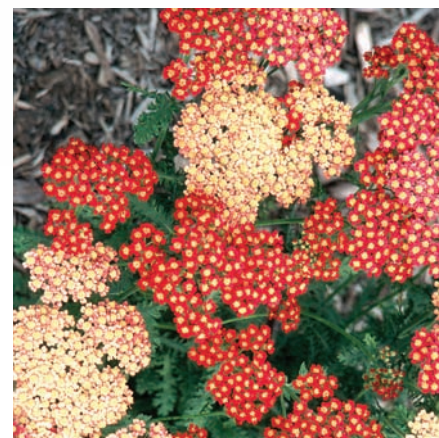
Achillea 'Strawberry Seduction'