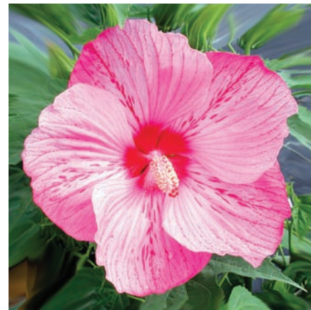
Hibiscus 'Peppermint Schnapps'

• Grow 3½ ft. tall and 3 ft. wide with 8- to 10-inch blooms.