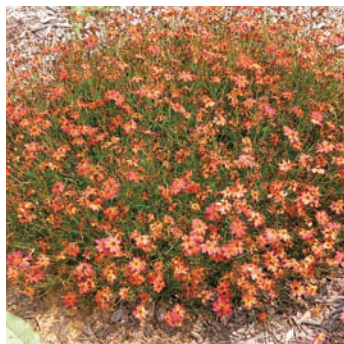
Coreopsis 'Limerock Dream'

'Limerock Dream'. Coreopsis 'Limerock Dream', from Blooms of Bressingham, features daisy-shaped blooms that are apricot-pink in spring and rich green foliage. The blooms turn copper-orange in the summer heat.