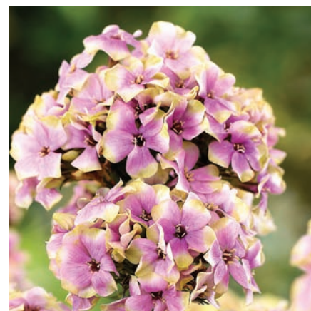
Phlox 'Sherbet Cocktail'