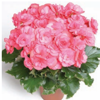
Begonia 'Rhine Dragona'

The Rhine begonia series from Dümmer USA has three new colors for 2007: Borias (soft pink), Dragona (rich pink) and Olympic Red (deep red). Each is a vigorous grower and suitable for pot production and container or landscape use.