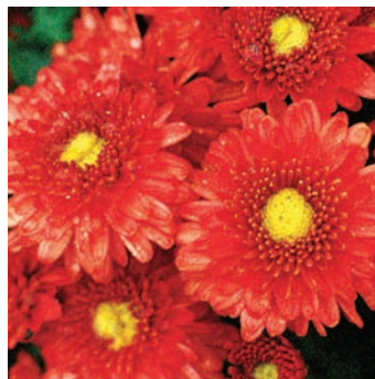
Dendranthema 'Rosy Igloo'