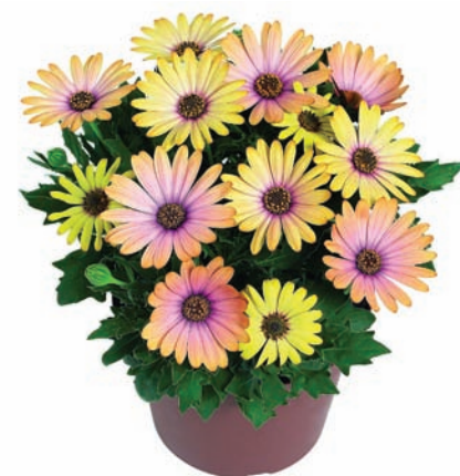
Osteospermum 'Summertime Sunset'

• Do not water excessively to avoid slow plant development and stretch.