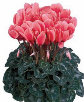
Cyclamen 'Dhiva Salmon'

Morel Diffusion introduced the fancy type 'Dhiva Salmon' to its Halios series, which already includes 16 colors and eight other fancy varieties. A compact plant, 'Dhiva Salmon' has large, striated petals that are rounded and arranged in a fan shape.