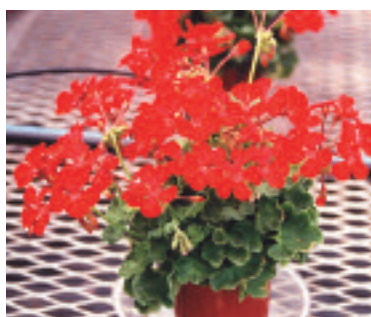
'Piccolino Dark Red'

Florel can be used early to improve branching but is usually not needed. Some keys to success are to avoid water and heat stress when the plants are mature. Grow similarly as double impatiens or New Guinea impatiens. This new series generally doesn't need any pinching if the cuttings are compact and well branched. It will trail and cascade very well and not mound up.