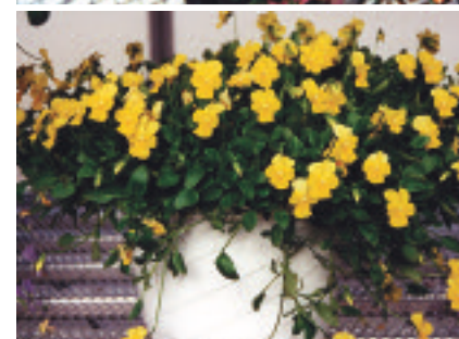
Top: 'Amalia Orange'. Bottom: 'Violina Yellow'.

ing and very fragrant series: Pink, White, Cerise, Yellow, Orange, Dark Red, Duo Pink and Duo Purple. The Duos are best matched in habit. Fides recommends the vigorous series for gardens and terraces. The series flowers abundantly until late fall, and during the winter, it resists light frost.