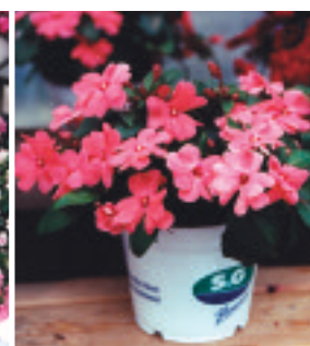
'Kokomo Petite Salmon'