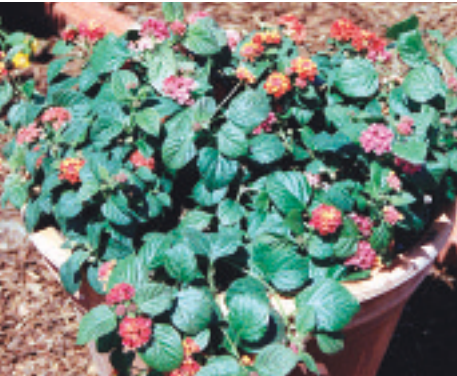
‘Florida Mound Red’