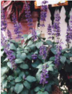
‘Mystic Spires Blue’