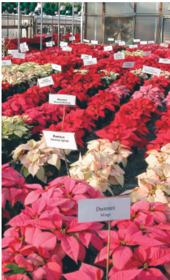
Figure 6. The top five consumer selections of the novelty cultivars.

North Carolina State University. The North Carolina State survey is conducted at a ▶