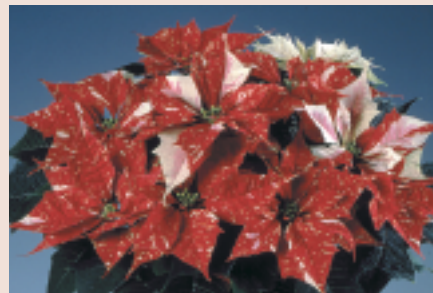
Counter-Clockwise from top: 'Autumn Red' (Ecke); 'Cortez Burgundy' (Fischer); 'Mars' (Fischer); 'Santa Claus Marble' (Selecta); 'Sonora White Glitter' (Fischer); 'Monet Twilight' (Ecke); Merlot' (Dummen).