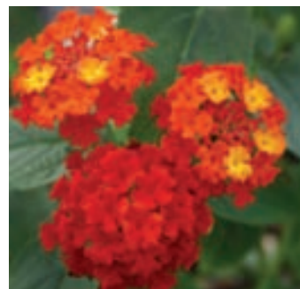
LUSCIOUS™ Citrus Blend™