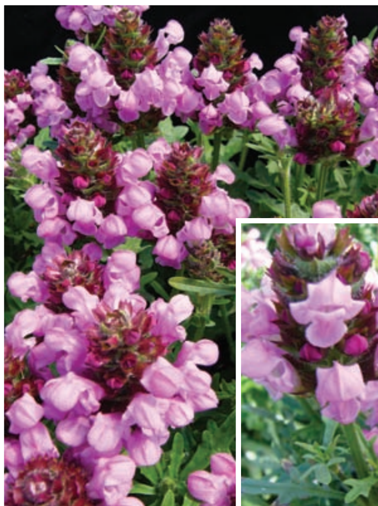
With its vibrant, large blooms, 'Summer Daze' is sure to inspire impulse sales.

Place the cuttings under a low misting regime for the first seven to 10 days of propagation. When ►