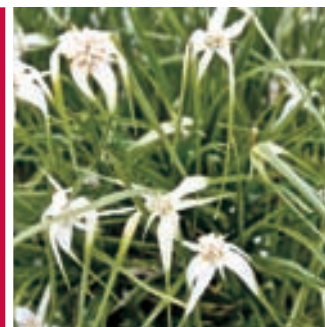
White Star Grass