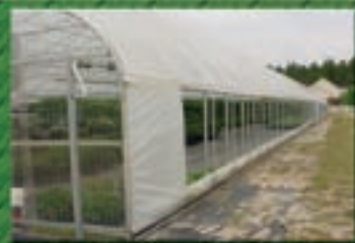
Z-Lock™ Drop-Down Curtain