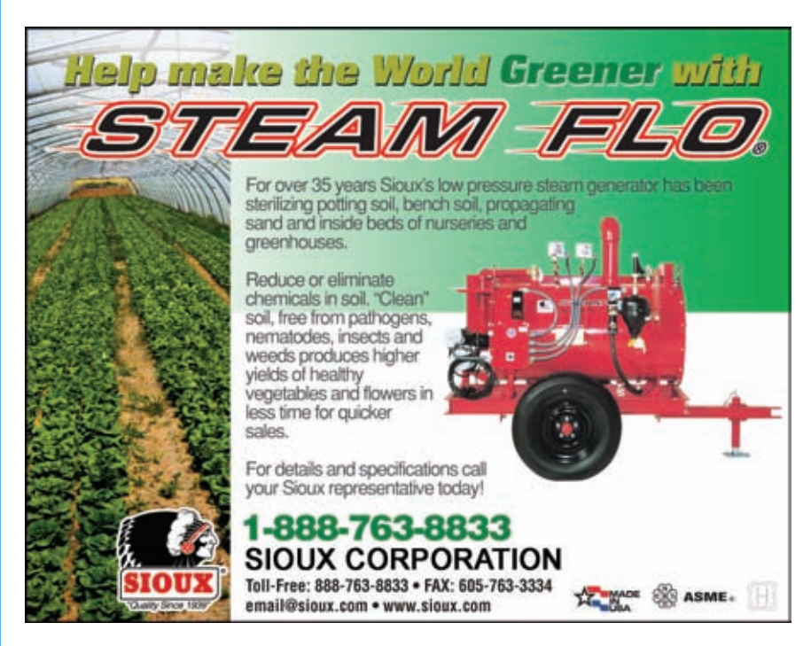
Write in 794