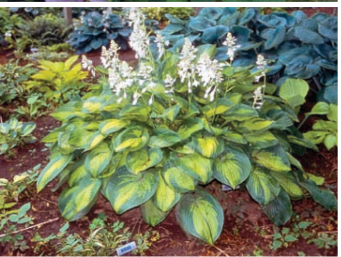
Top: Osteospermum 'Asti White'. Middle: Viola 'Skippy XL Plum-Gold'. Bottom: Hosta 'Paradigm'.