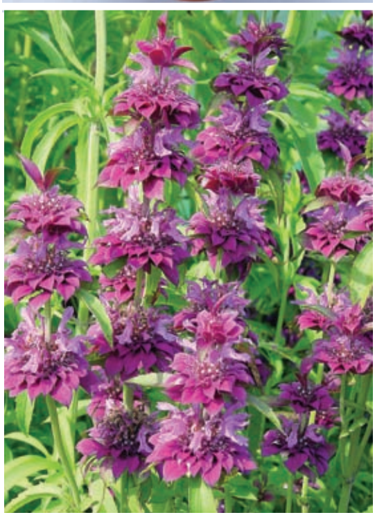
Top: Delphinium 'Sydney Light Blue'. Middle: Lavandula 'Ellagance Purple'. Bottom: Monarda 'Bergamo'.

is the flea beetle. Although it is a dried cut flower, it can also be used fresh.