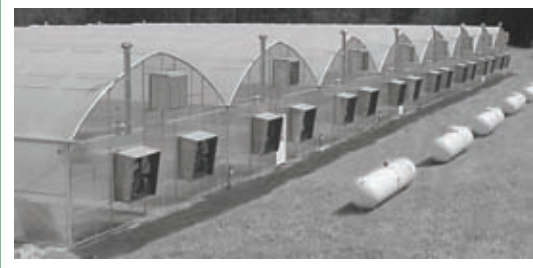
20' to 30' Wide Frames w/ Gutters As Low As $1.75 / Square Foot