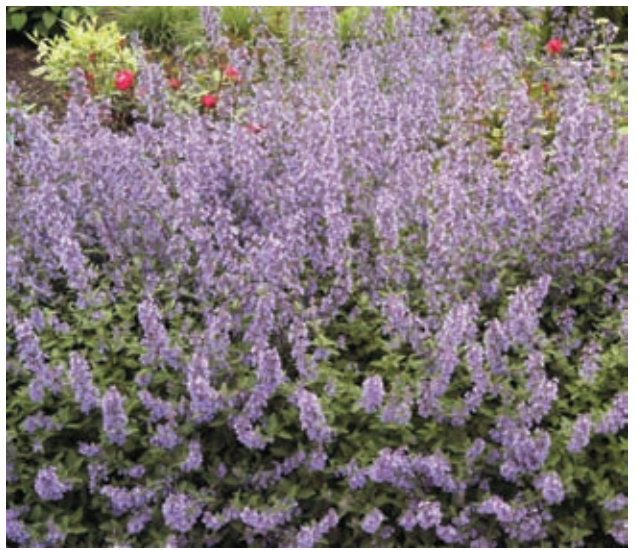
Top: Carnation 'Margarita'. Bottom: Nepeta 'Walker's Low'.

and compact habit with thick stems. It reaches approximately 15-16 inches tall. Sow at 64° F in early March, and grow at 57° F. Plant out in May.