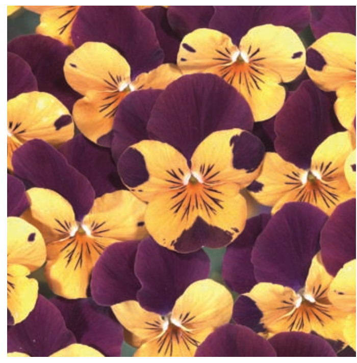
Top: Rudbeckia 'Cappuccino'. Middle: Salvia 'Fairy Queen'. Bottom: Viola 'Floral Power'.