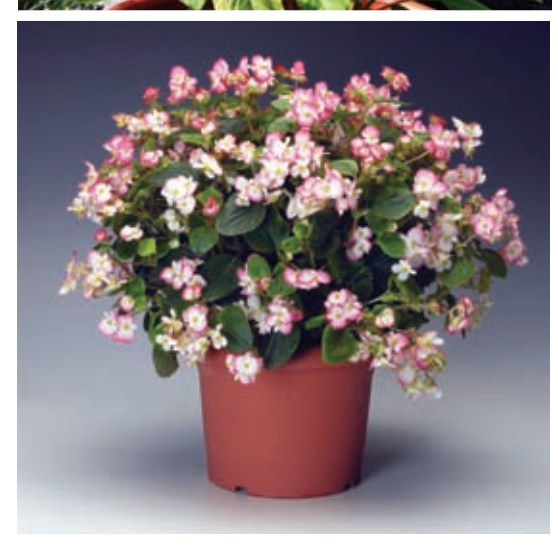
Top: Hydrangea 'Limelight'. Middle: Amaranthus 'Hot Biscuits'. Bottom: Begonia 'Volumia Rose Bicolor'.