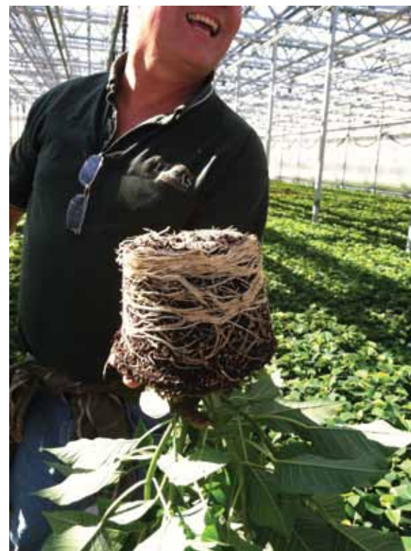
Top: Stages of biofilm development.