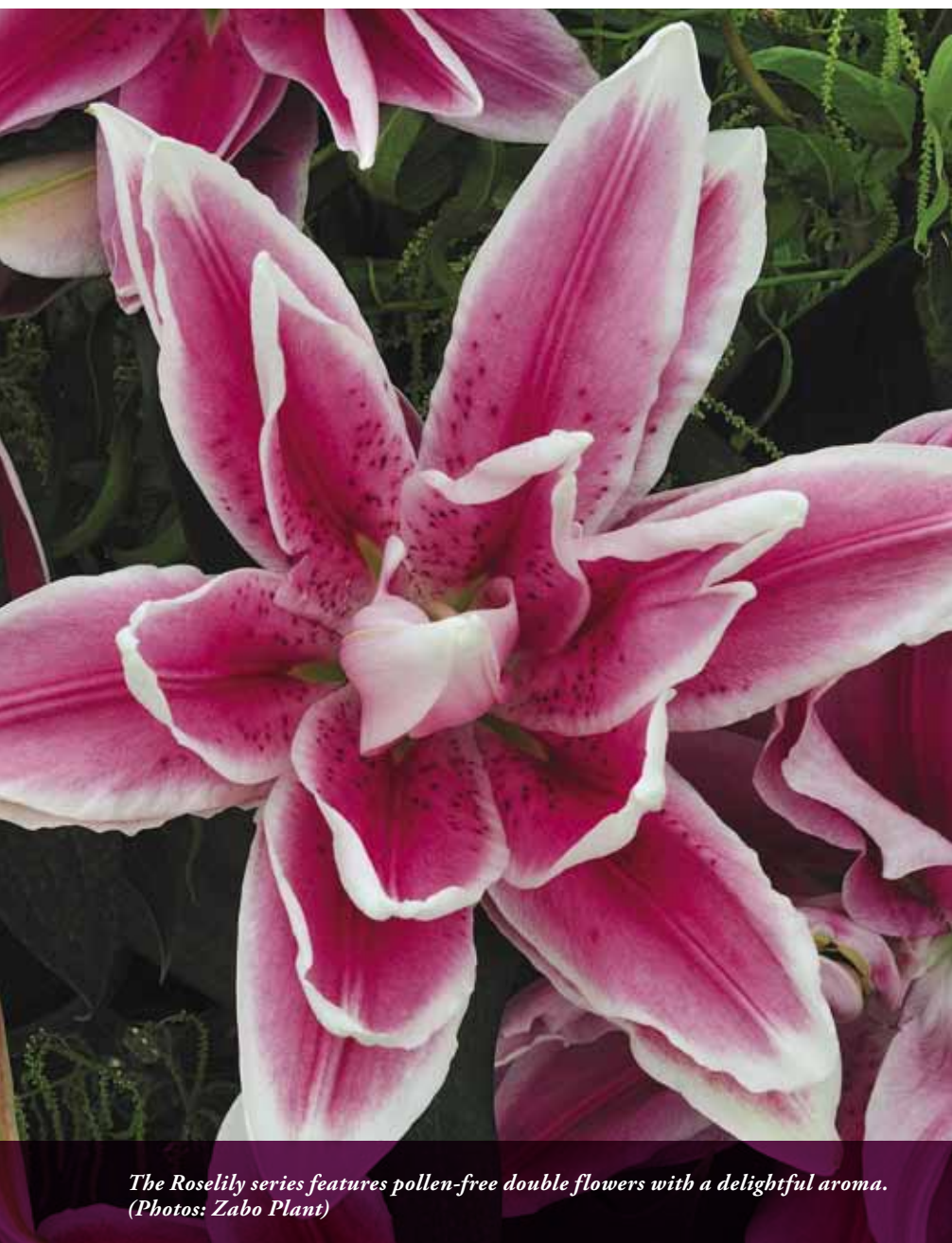
The Roselily series features pollen-free double flowers with a delightful aroma.

The Roselily series is suitable for production in 1-quart to 2-gallon containers. Oriental lilies perform best when they are grown in moist, well-drained growing mixes. The number of bulbs to plant into each pot varies with the container size,