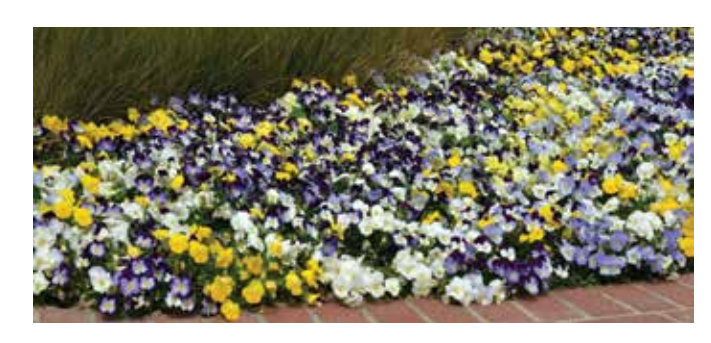
Cool Wave pansies are a great option for early spring turns.

sustainability." Keeping your finger on the pulse of consumer gardening trends can put you ahead of the game. So when you read about movements toward eliminating turf grass and an increased awareness in pollinators, it's time to take stock of your plant list. Beyond