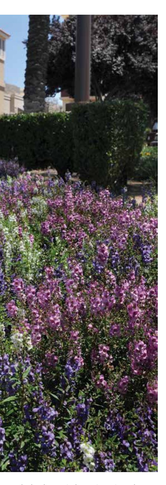
The landscape industry is projected to grow over the next few years as renewed government investment around infrastructure fuels opportunities for the next generation of plants.

Claire Watson is product marketing manager for PanAmerican Seed, stationed in West Chicago, Illinois. To learn more about the landscape plant collection, visit www.panamseed.com/landscape.