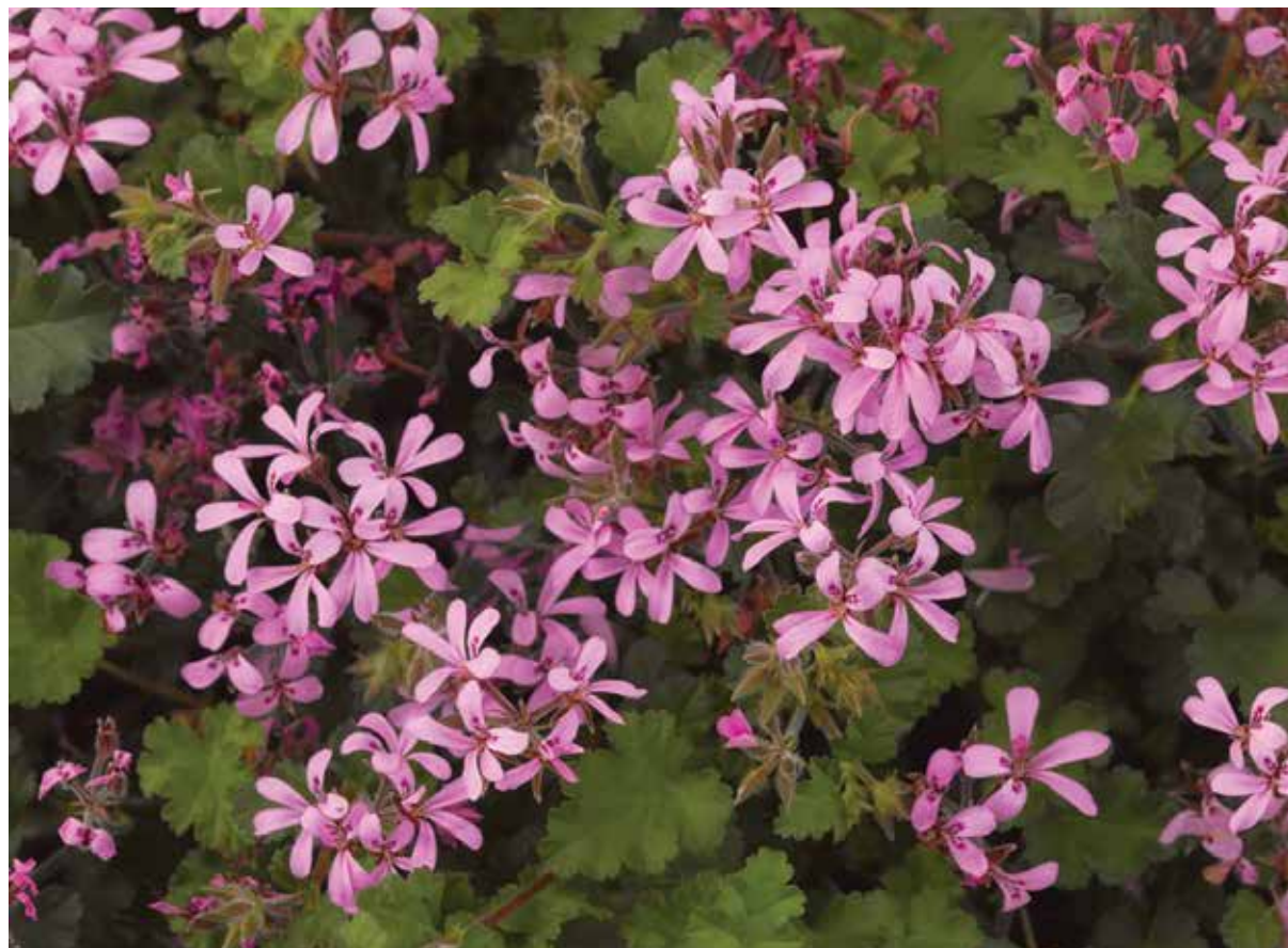
Pelargonium 'Pinki Pinks' is a low growing perennial shrub that is a natural favorite for bees, butterflies and hummingbirds.