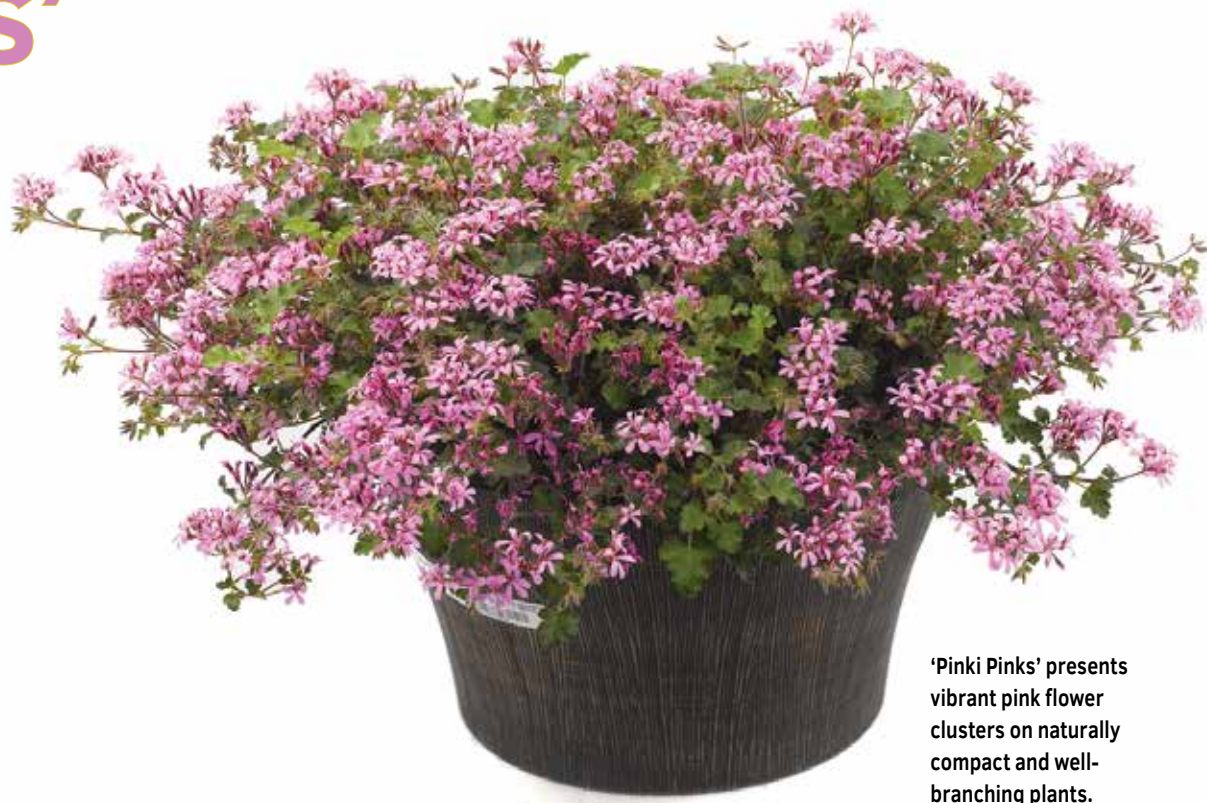
'Pinki Pinks' presents vibrant pink flower clusters on naturally compact and well-branching plants.

Gaudi Violet features strong, healthy foliage and produces abundant flowers that rebloom sporadically.