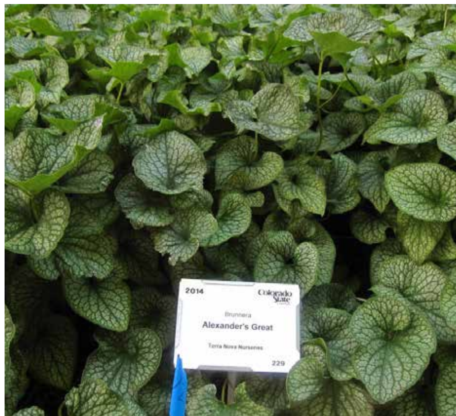
Brunnera macrophylla 'Alexander's Great'

demonstrated a harvest-gold pattern with magenta and hot pink splotches. This series has application in landscape beds as well with a superb spreading branching habit. 'Color Clouds Spicy' was trialed in beds and containers in full sun and shade with great adaptability.