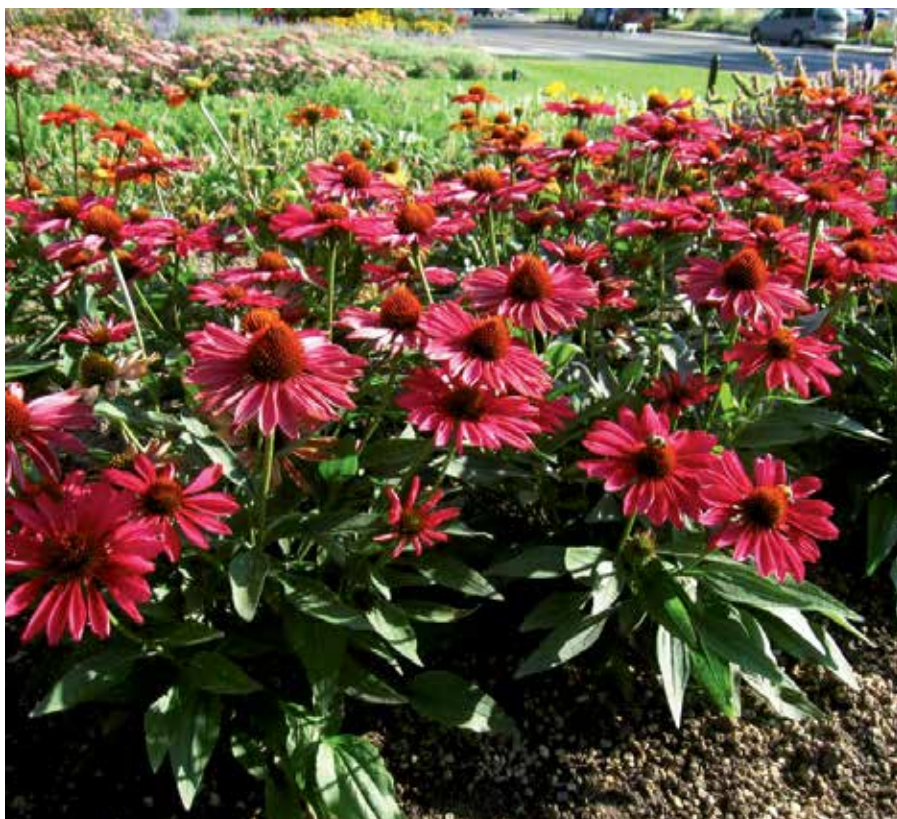
Echinacea 'Kismet Raspberry'