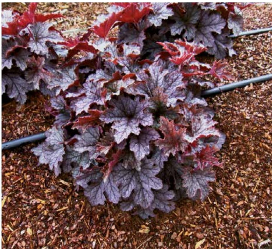
Heucherella 'Plum Cascade'