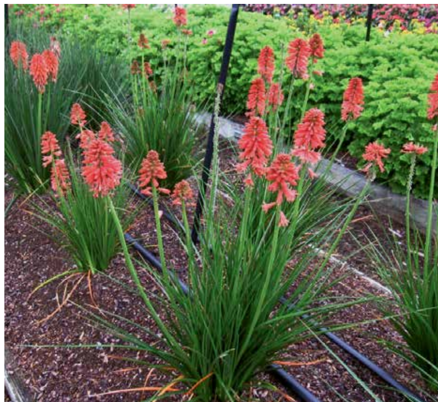
Kniphofia 'Poco Red'