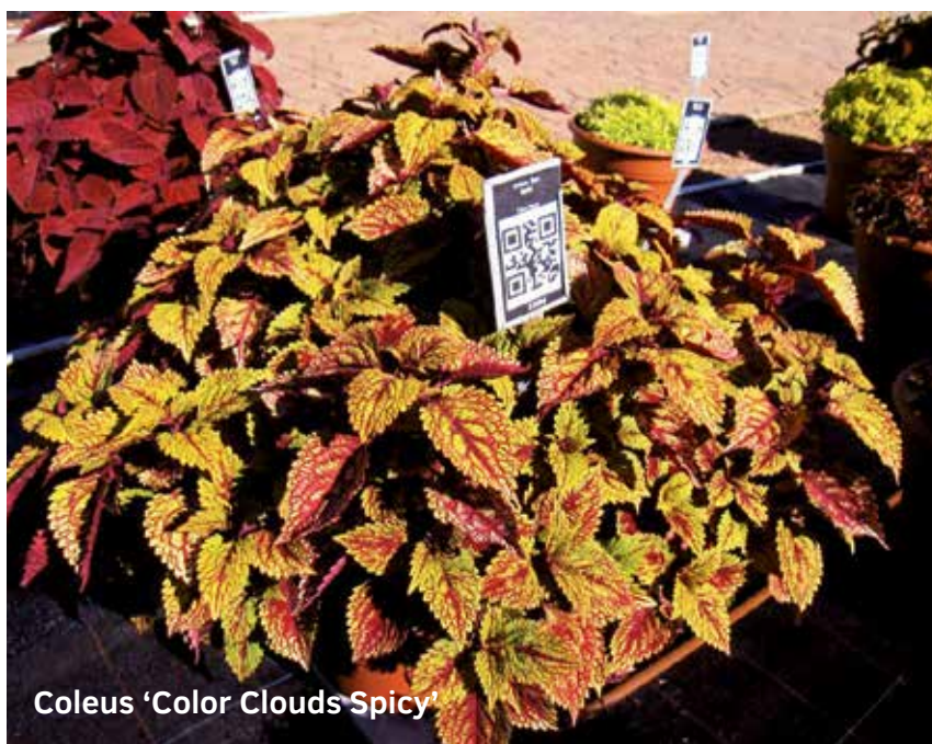
Coleus 'Color Clouds Spicy'

non-fading variety. Ruffled green with striking red venation with a chartreuse background. This variety was striking in multiple trial sites.