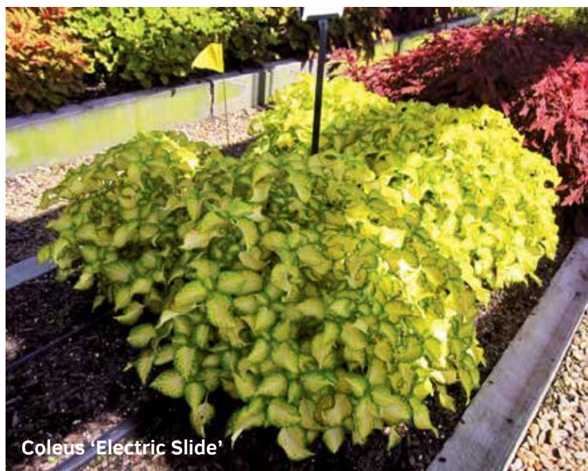
Coleus 'Electric Slide'

Coleus 'Electric Slide'. A naturally self branching, compact,