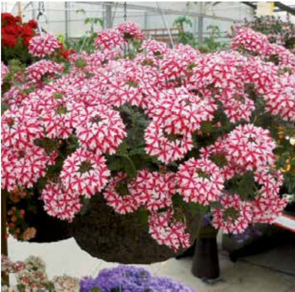
Left to right: ‘Callie Rose’ calibrachoa, ‘Techno Heat Upright’ lobelia and ‘Lanai Candy Cane’ verbena, all grown with proper PGR, light and fertility.

growth and improve plant habit. Make sure plants have a good root system before dropping temperatures. Preventative fungicide drenches are highly recommended on this crop. • Calibrachoa are long-day plants that generally need at least 12 hours of day length to flower. Newer breeding and product lines, however, are being selected for shorter photoperiod flowering responses. Understanding specific