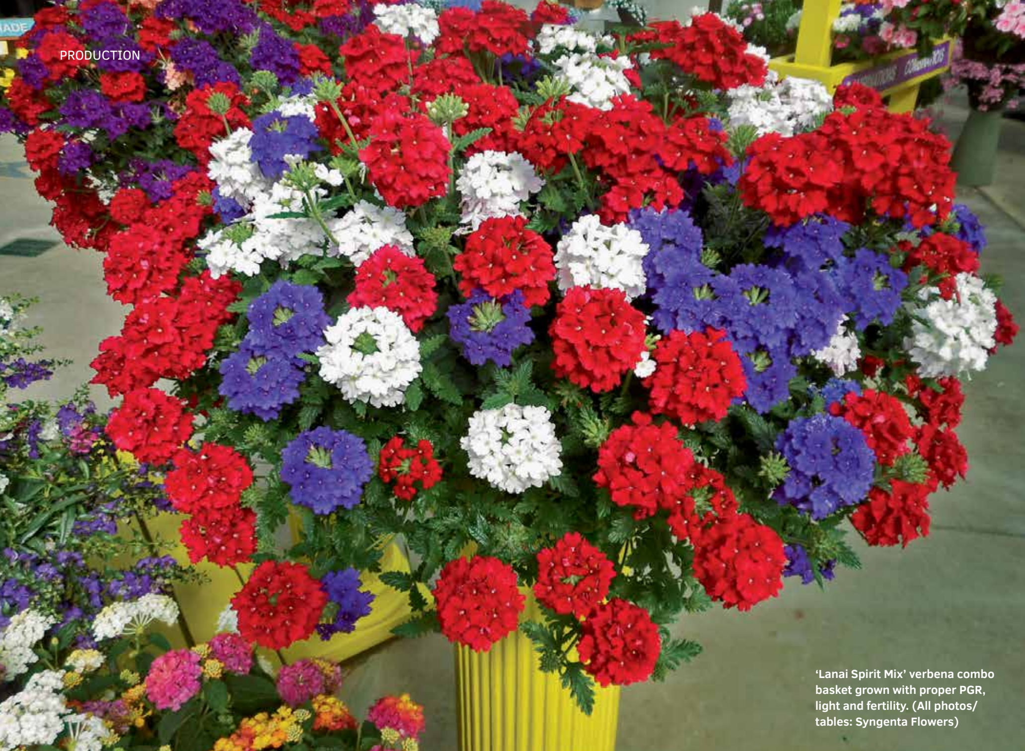
'Lanai Spirit Mix' verbena combo basket grown with proper PGR, light and fertility. (All photos/tables: Syngenta Flowers)