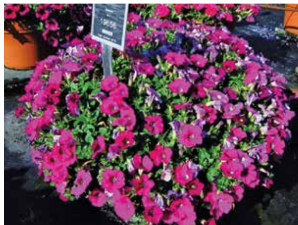
Petunia 'Veranda Magenta'