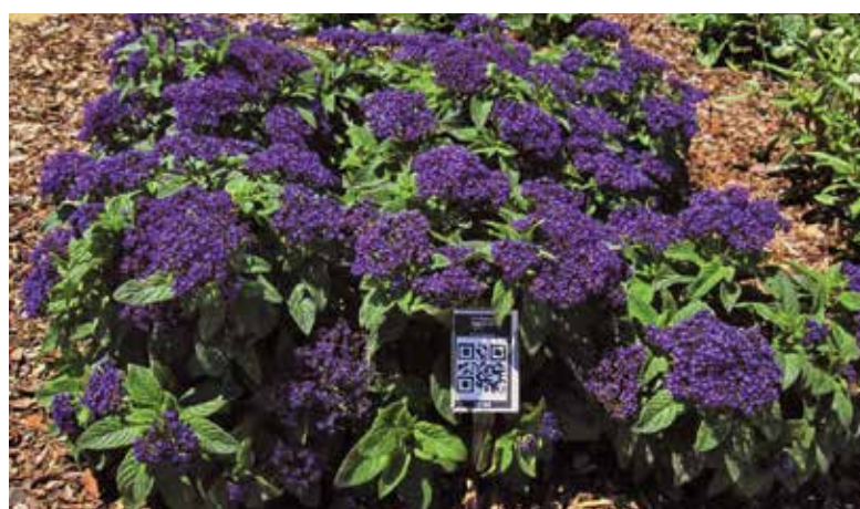
Heliotrope 'Midnight Sky'

landscape plant for backgrounds. At retail, it is marketed in 5- to 6-inch containers and is added to mixed containers as a thriller.