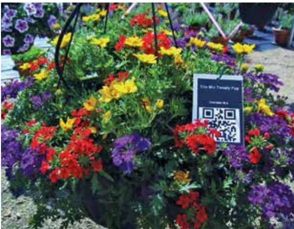
'Trio Mio Tweety Pie'