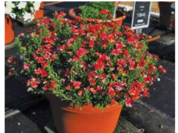
Nemesia 'Nessie Plus Orange'

10 seed and vegetative varieties and plant performance was excellent across many colors.