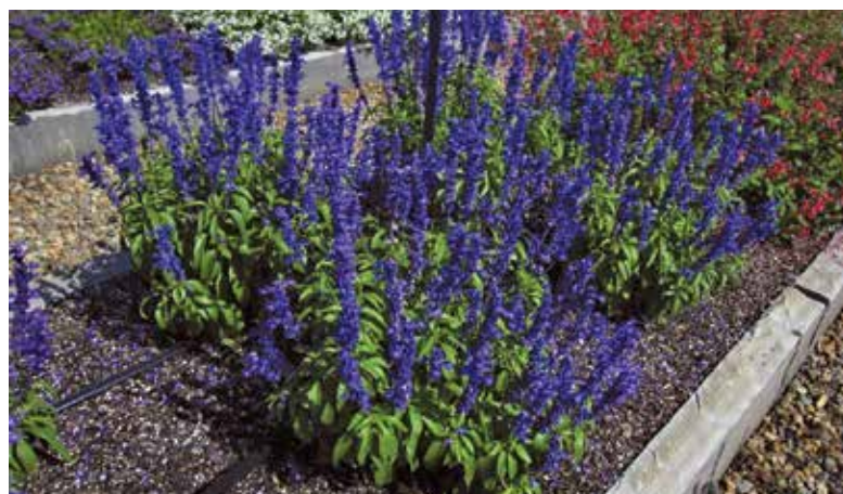
Salvia 'Midnight Candle'

Saucy salvia has vibrant flowers with a homogenous flower habit. It matures at 2 to 3 feet with a large, sterile flower spike creating vibrant, eye-catching color from near and far. It makes an excellent