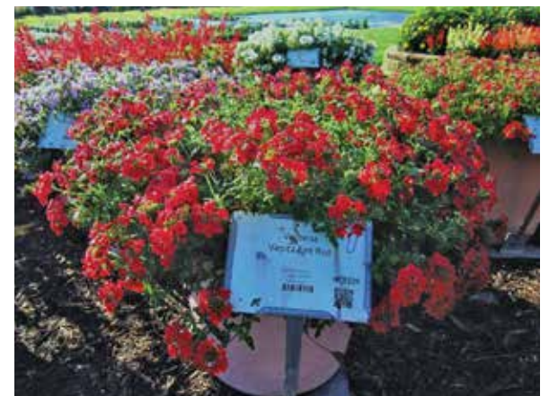
Verbena 'Vepita Fire Red'