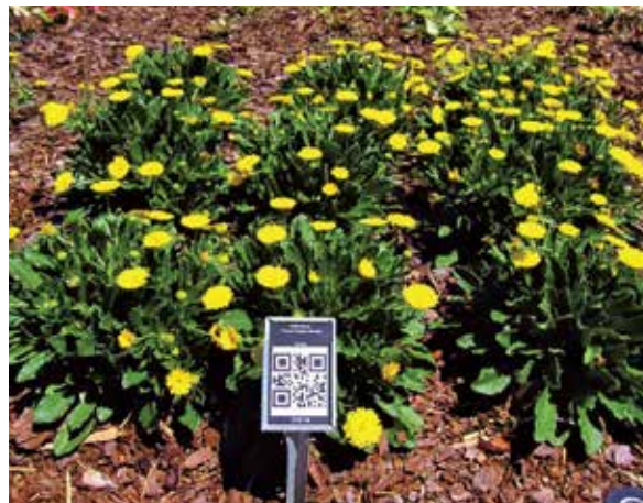
Calendula 'Power Daisy'