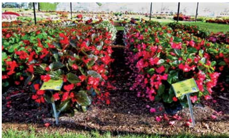
Begonia Megawatt Series