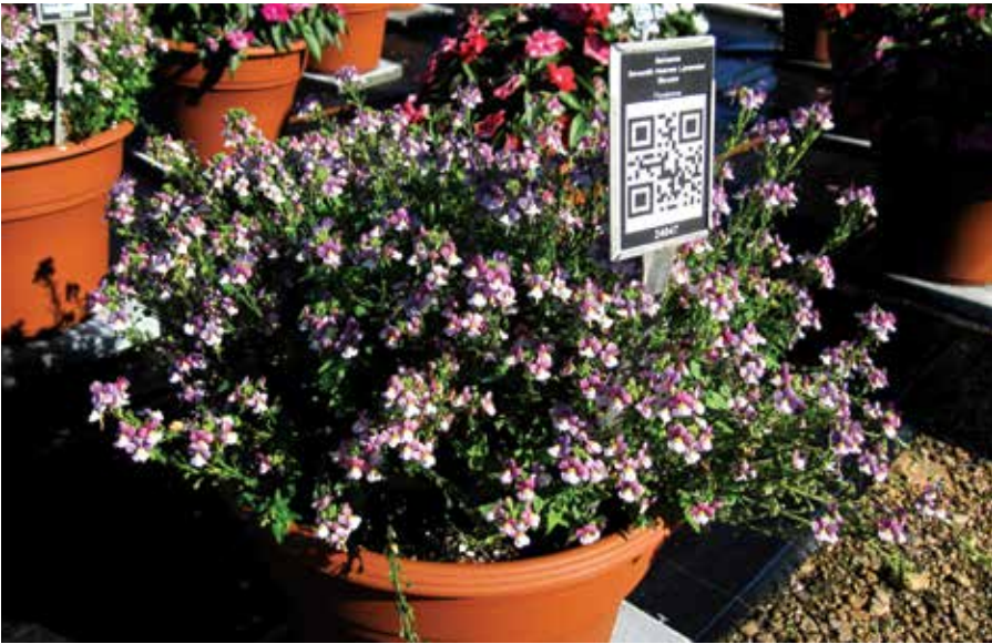
Nemesia 'Seventh Heaven Lavender Bicolor'