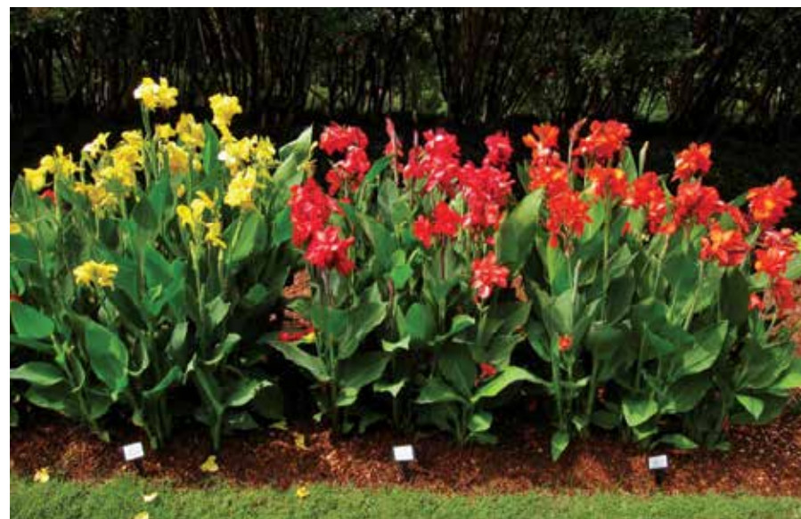
Canna Cannova Series

today; what are the distinguishing features of this series? I have evaluated Cannova in southern and northern trials the past two years and in spring production throughout the country. The word that comes to mind is versatility . The series is characterized by uniformity, unblemished foliage, heat tolerance, cold tolerance in spring production, vibrant colors and adaptability in quarts, gallons and mixed containers. It has been used in landscape plantings in mass beds or as a thriller. Cannas should be a part of every grower's spring production. The most important aspect is long-lasting performance, which results in success for landscapers and consumers.