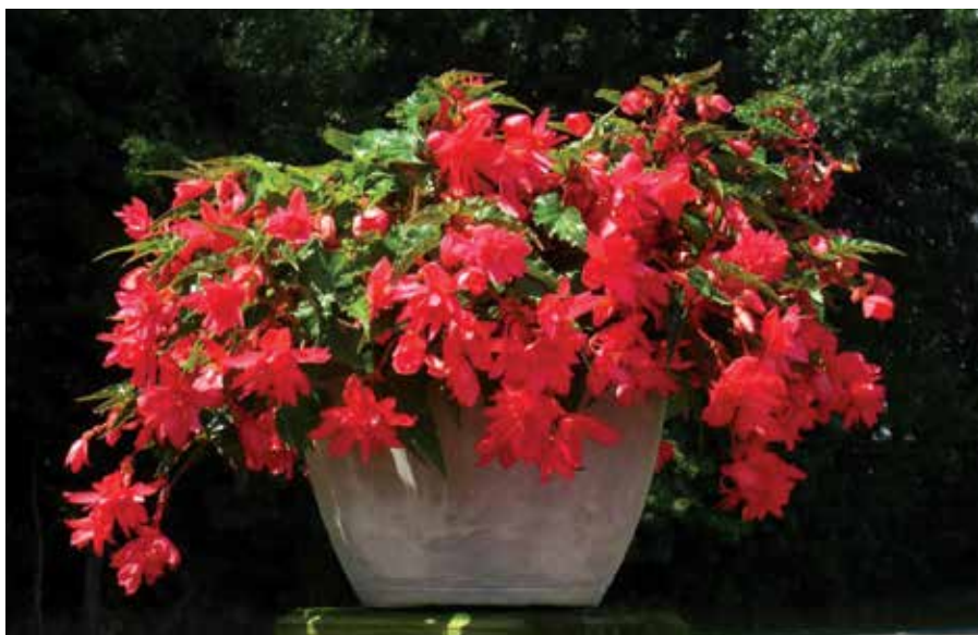
Begonia 'Funky Pink'