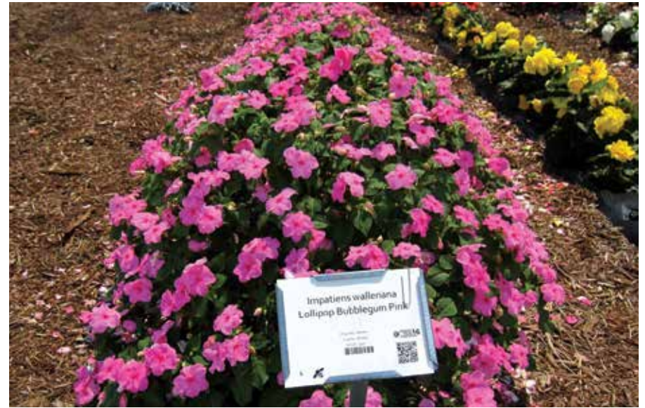
Impatiens 'Lollipop Bubblegum Pink'