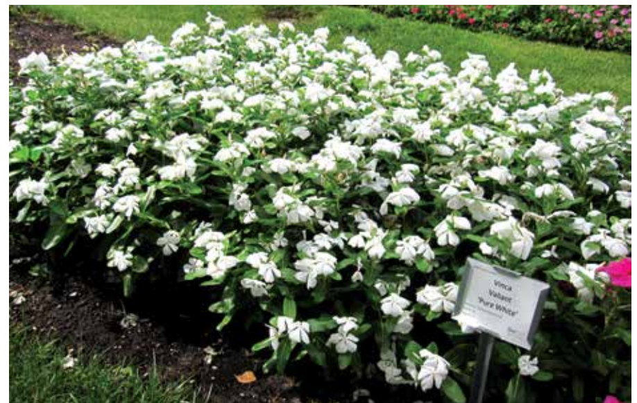
Vinca 'Valiant Pure White'