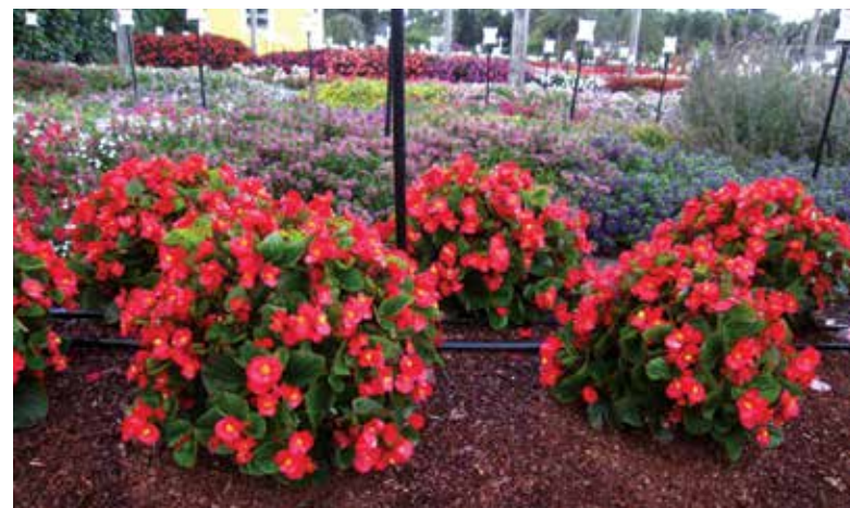
Begonia 'Top Spin Scarlet'