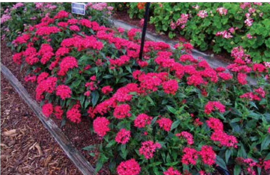
Pentas 'Bee Bright Lipstick'