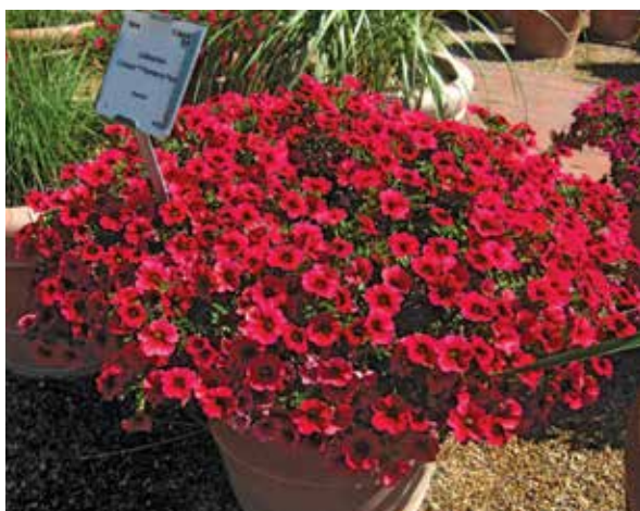
Calibrachoa 'Calitastic Plumberry Punch'