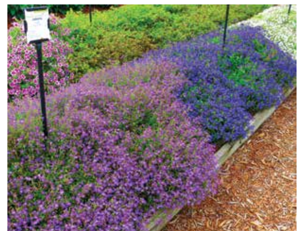
Lobelia Hot Series

were characterized by a blend of colors in the ground or in containers. This is a vigorous series with application in monoculture or mixed baskets and containers. The series was trialed in multiple locations last summer, and all varieties maintained the flower pattern with slight variations from early summer through fall with a consistent growth habit. A few varieties stood out with vibrant multicolored flowers and excellent floriferousness. The top performer was Sunshine Berry, with a very distinct color pattern in the ground or containers followed by Blueberry Scone and Cherry Banana.