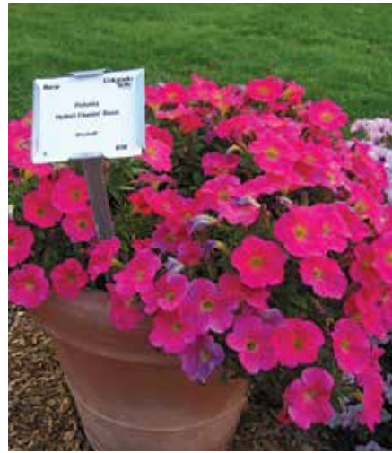
Petunia 'Hells Flamin' Rose'