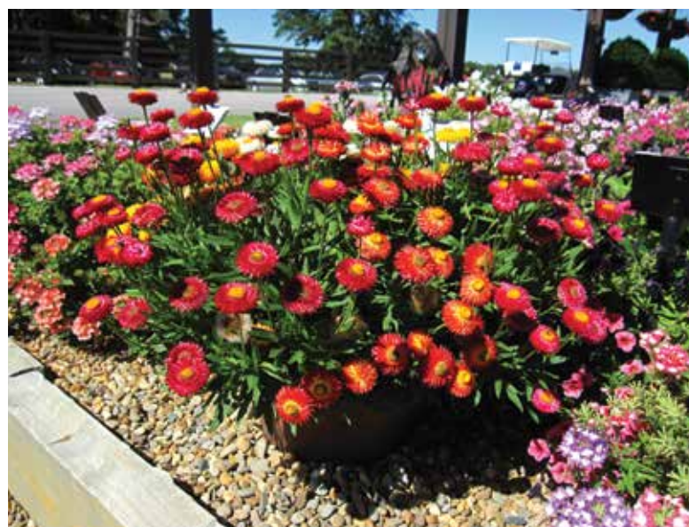
Bracteantha 'Cottage Bronze'

There were three competitive series of genetically compact calibrachoa introduced in 2017, including Calitastic . This series