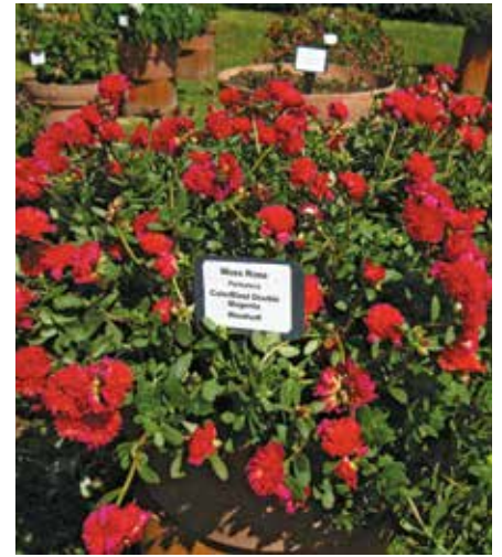
Portulaca 'ColorBlast Double Magenta'

novel. With 35 colors in the series, there is something for everyone. I promoted and sold these when they were introduced, and growers used them in many production programs including quarts, mixed and monoculture containers, and baskets. Some of the most popular varieties include Black Mamba, one of the best black petunias in the industry with no fading or striping; Red/Blues, a vibrant red with dark center and exceptional uniformity; and Cherry Cheesecake, an excellent red/white striping and non fading color. As I mentioned earlier this is a collection of colors with different growth rates. The standouts in last summer's trials included Good Night, Citrus Twist, Lucky Lilac and Moonstruck. Coincidentally, at the Welby container trial in August consisting of more than 900 containers, the breeders, growers and