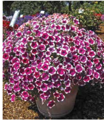
Petunia 'Big Deal Pinkadilly Circus'