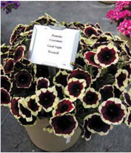
Petunia 'Crazytunia Good Night'