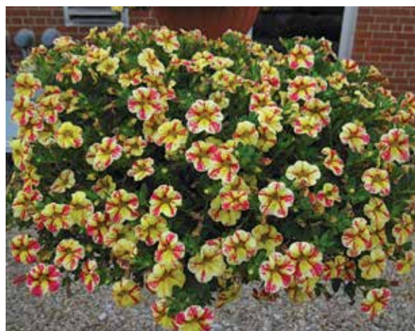
Calibrachoa 'Candy Shop Candy Bouquet'