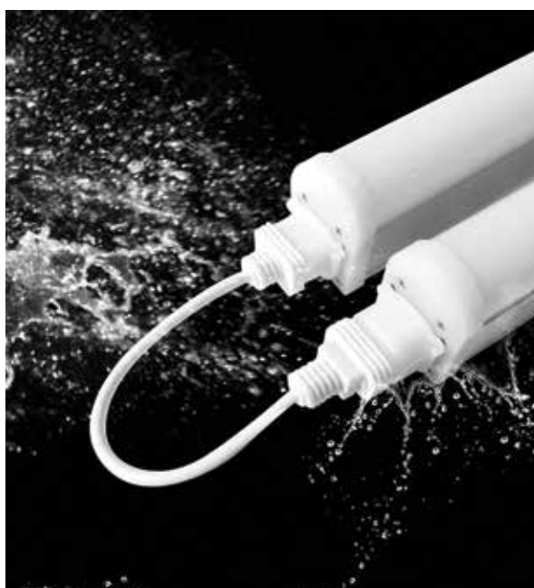
Infinity light bar.