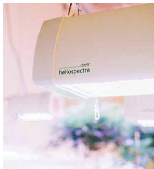
LX60 LED lighting.

energy (intensity) is the micromole ( \mu\text{mol} ). Next, some descriptors of intensity refer to light generated by the fixture, while other descriptors refer to the intensity of light striking a surface. Photosynthetic photon flux (PPF), measured as \mu\text{mol}/\text{s} (s=second), describes an instantaneous measure of light intensity produced by a fixture. However, fixtures vary greatly in how this light is directed. Some fixtures have a more focused dispersal pattern and some have a wider dispersal pattern. The photosynthetic photon flux density (PPFD) considers both fixture output and dispersal. PPFD describes light intensity delivered to a surface and is measured as \mu\text{mol}/\text{m}^2/\text{s} (micromoles of light hitting a square meter in one second). PPFD is also an instantaneous measure of light intensity. Remember that the PPFD reported for a fixture is specific to the distance at which the measurement is taken.