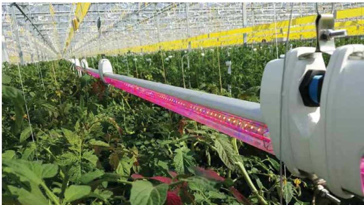
HortiLED lighting.