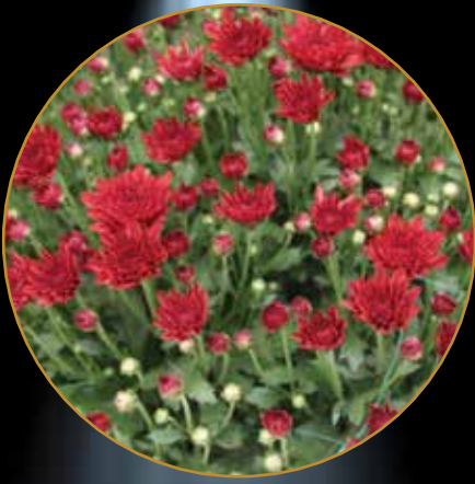
Chrysanthemum 'Vigorelli Red' Gediflora

Red is the third color to the Vigorelli line of Belgian mums. It is a late variety, blooming mid to late October. More colors are in the pipeline.