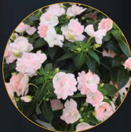
New Guinea Impatiens Wild Romance Series Dümmen Orange

This variegated lomandra is lightly colored, providing great contrast in the garden. It handles full sun but prefers light to moderate shade. It is hardy to Zones 8 through 10 and reaches 2 feet tall and 3 feet wide.