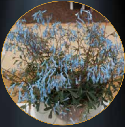
Corydalis 'Hillier Porcelain Blue' Plant Haven

'Solar Dance' is a grandiflora type with semi-double lemon yellow flowers. It continuously flowers from June to October and is hardy to Zone 4.