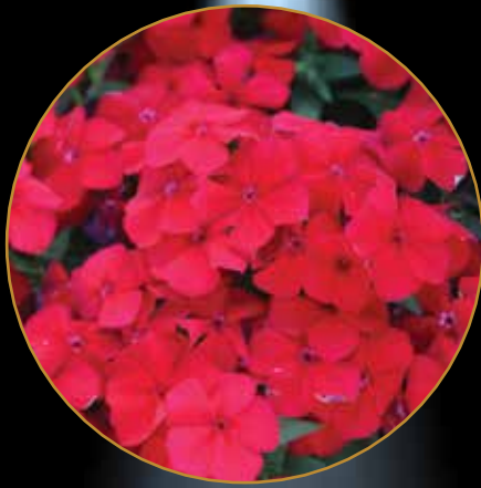
Phlox 'Intensia Red Hot' Proven Winners

Marketed as the earliest petunia series in the industry, the SUCCESS! series now has a unique bicolor, Pink Star, in the uniform and top-quality seed collection. The star pattern is very stable and eye-catching.