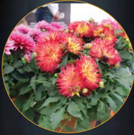
Dahlia LaBella Maggiore Series Beekenkamp

This truly unique variety produces an abundance of highly fragrant clusters of bright blue flowers on a well-branched plant. It blooms nonstop from spring through fall and will create an attractive presentation in sun or shade.