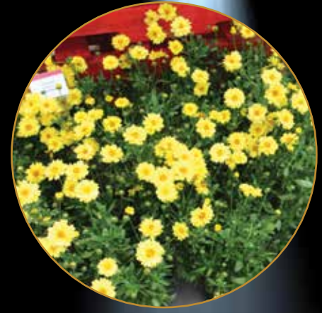
Coreopsis 'Solar Dance' Cultivaris

Great Falls is a totally new series of trailing coleus, perfect for monoculture or mixed baskets and planters. It has a very controlled habit with smaller foliage, and it is late to flower. Dümmen Orange has also added Great Falls coleus to its Confetti Garden mixes.