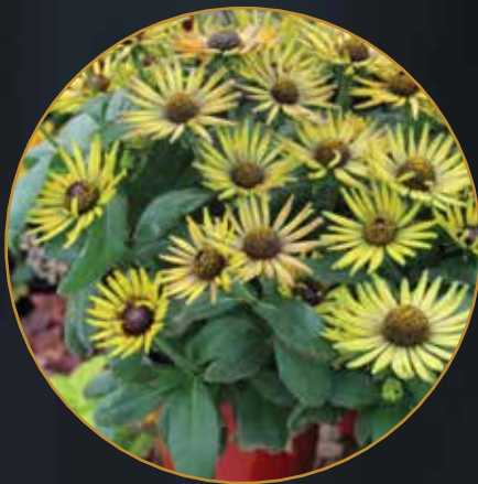
Echibeckia 'Summerina Electra Shock' Pacific Plug & Liner

This dahlia has large double flowers with an eye-catching almost bicolor effect. It flowers all summer long and is ideal for beds, window boxes and hanging baskets.