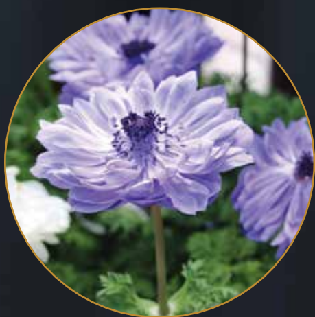
Anemone Harmony Double Series Sakata

It is certainly no easy feat, but Team GPN managed to put together a list of some of the most impressive introductions that made a statement and turned heads during the 2017 California Spring Trials. With hundreds of new varieties on display, keep in mind this is only a small fraction of what will be in store for next season. We'll continue to share more new variety information with you in coming months.