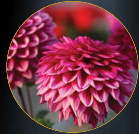
Dahlia 'Lubega Power Burgundy' Volmary

Beekenkamp offers four different subseries of dahlia in different size categories — the most impressive being the largest one, Maggiore. The flowers are huge, and colors are eye catching. Growers can produce one plant in a 10-inch pot.