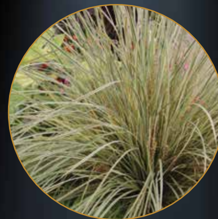
Lomandra 'Platinum Beauty' Southern Living Plant Collection

Hardy to Zones 4 through 8, lewisia 'Constant Coral' blooms and reblooms from spring to fall. Flowers are coral pink in color and are display over vigorous deep green leaves. It is easy to grow in gardens or containers and prefers full sun.