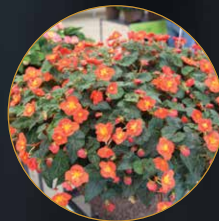
Begonia RiseUp Series Westhoff

This new begonia variety features the dark foliage of the Mocca series but with the semi-trailing habit of Joy. The huge white flowers contrast nicely against the leaves, creating a beautiful basket presentation.