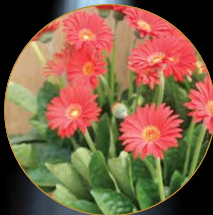
Gerbera 'Garvinea Sweet Love' Florist Holland

Sweet Love is the newest addition and first red color in the Sweet collection. It features true red, super-sized flowers. It will look incredible mass planted or in decorative containers. Garvinea Sweet varieties flower continuously from early spring until first frost.