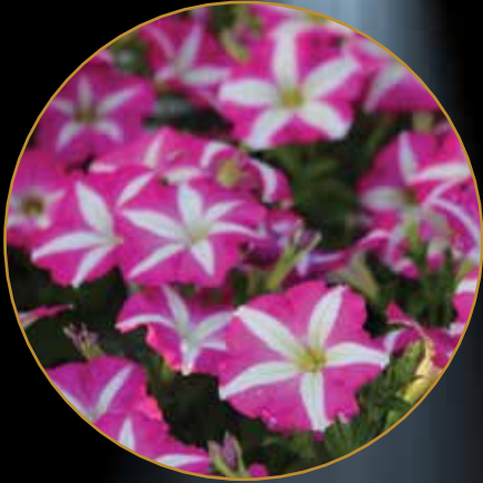
Petunia 'SUCCESS! Pink Star' Benary

Marketed as the earliest petunia series in the industry, the SUCCESS! series now has a unique bicolor, Pink Star, in the uniform and top-quality seed collection. The star pattern is very stable and eye-catching.