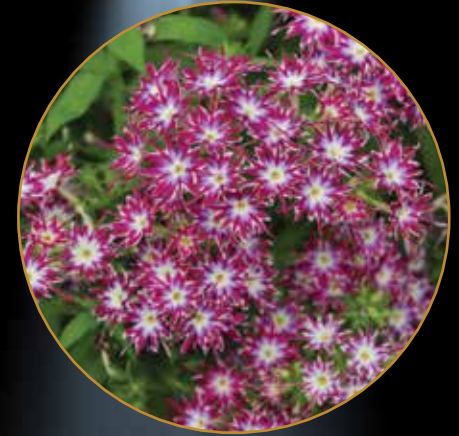
Phlox Popstars Series Floranova

This cold- and heat-tolerant selection is a heavy bloomer with true red flowers. It will bloom mid spring through summer and fall, and will even take a hard frost.