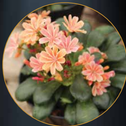
Lewisia 'Constant Coral' Terra Nova Nurseries

Compact Purple is a vibrant new addition to the SunPatiens line. It is a great summer performer that will pop off the bench and will be a fantastic component in mixed containers.