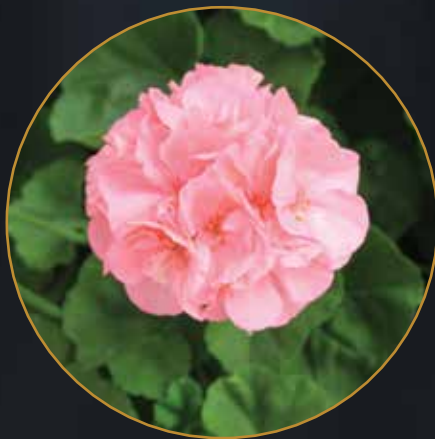
Geranium 'Calliope Large Salmon' Syngenta Flowers

Electra Shock features unique quill-type flowers, giving it a spider mum appearance. In cooler weather, flowers have more of a bronze hue. In warmer weather, flowers appear more yellow. It is hardy to Zones 7 through 9.