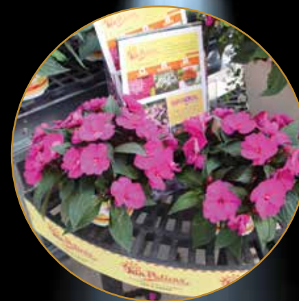
Impatiens 'SunPatiens Compact Purple' Sakata

Sweet Love is the newest addition and first red color in the Sweet collection. It features true red, super-sized flowers. It will look incredible mass planted or in decorative containers. Garvinea Sweet varieties flower continuously from early spring until first frost.