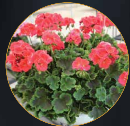
Geranium 'Chocolate Cherry' PAC

Syngenta Flowers continues to expand the color range of its Medium and Large Calliope varieties. The Large subseries has excellent performance in the landscape and thrives under heat and drought conditions.