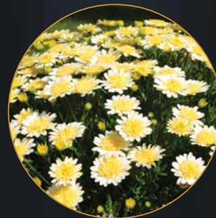
Osteospermum 'Bright Lights Double Moonglow' Proven Winners

Wild Romance is a true breeding advancement with romantic gardenia-like double blooms that perform best in shade. Plants boast a few extra petals, totaling seven to eight petals per flower. Two colors are currently available: White and Blush Pink.