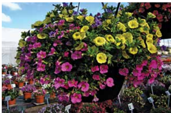
Mixmaster Spring Showers