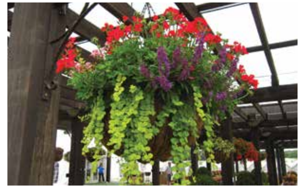
Marcada geranium, Angelmist angelonia and Goldilocks lysimachia combo

available in three colors — Pink, Purple and White Amethyst — and is available in Trixi mixes. The selling points include vigorous trailing habit, long season performance, single variety and combination application. This will be a significant addition to early spring basket programs with long season potential in the northern regions.