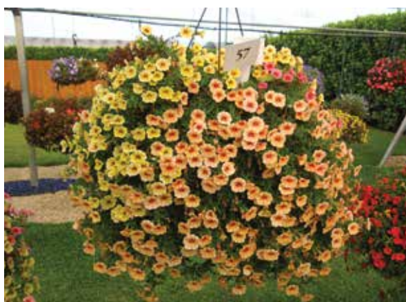
Trixi Batting Eye