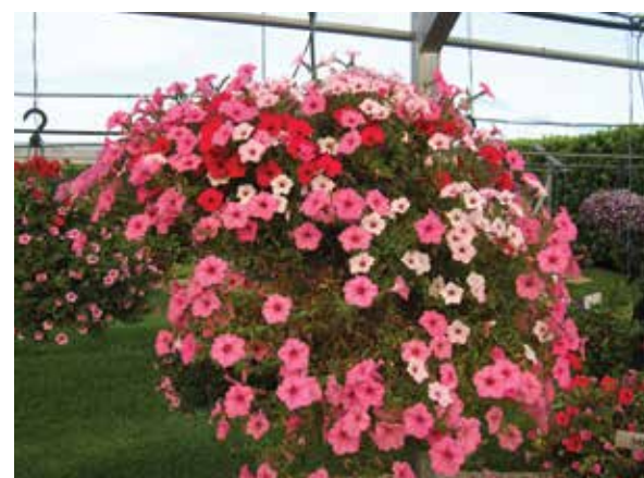
Above and Beyond