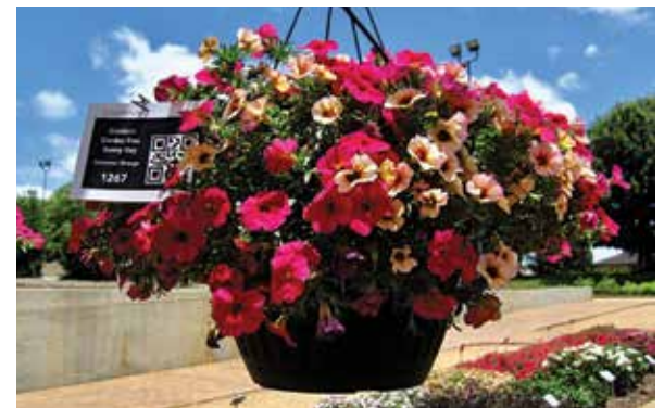
Confetti Garden Duo