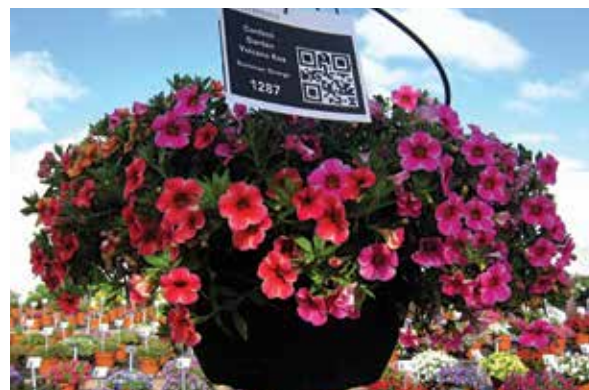
Confetti Garden Volcano Kea