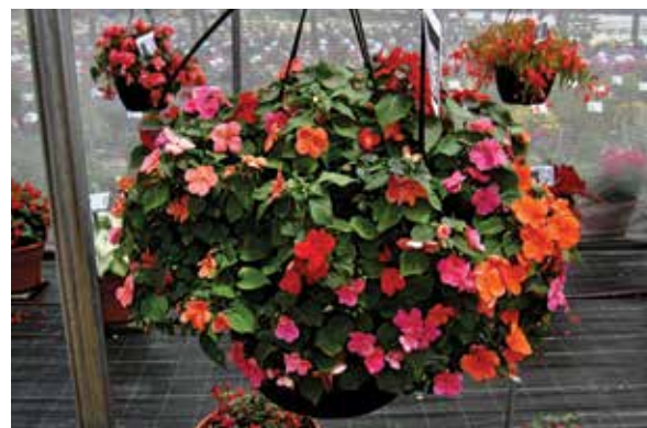
Lollipop Flaming Hot Melon Mix

Midwest. I was impressed with the flower size and stunning bicolor patterns of both varieties, but specifically Rose Quartz. This variety is unique and should be an essential part of all 2018 programs.