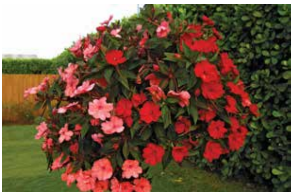
Summer Salsa Mix