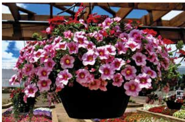
Confetti Garden Cherries on Top