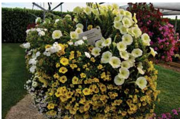
Plug and Play Lemon Dream