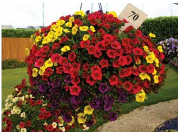
Confetti Garden Nani Hilo