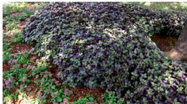
Alternanthera 'Little Ruby'