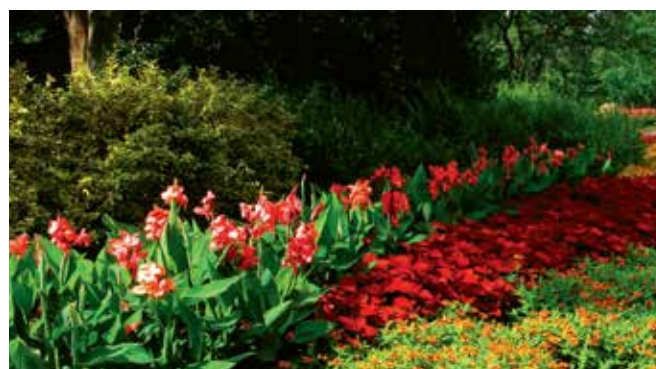
Canna Cannova and Coleus 'Red Head'