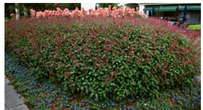
Salvia 'Wendy's Wish'