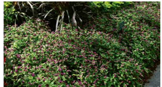
Gomphrena 'Pinball Purple'