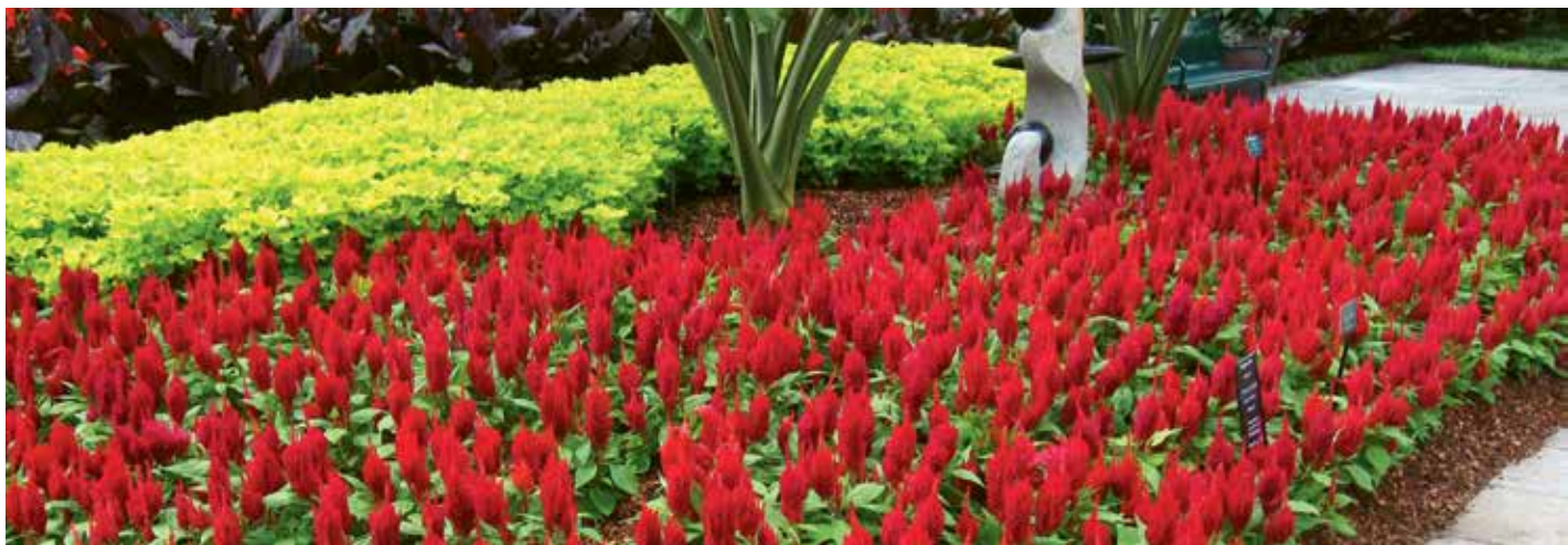
These top performers survived the heat and humidity in the landscape beds at the Dallas Arboretum trial garden.