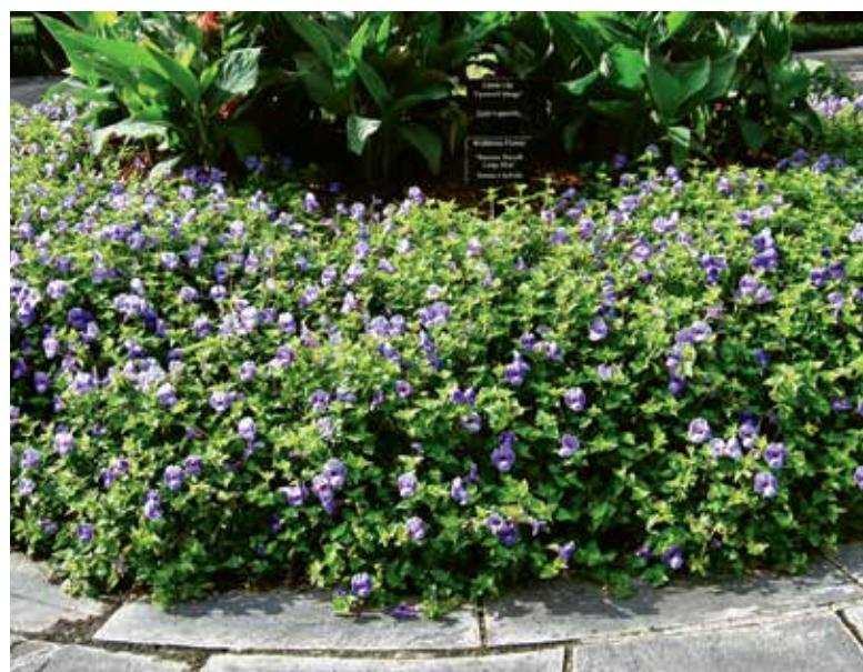
Torenia 'Summer Wave'