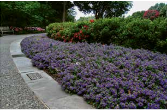
Scaevola 'Surdiva Classic Blue'