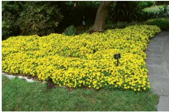
Portulaca 'Cupcake Yellow Chrome'