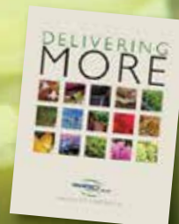
Call to request our DELIVERING MORE brochure