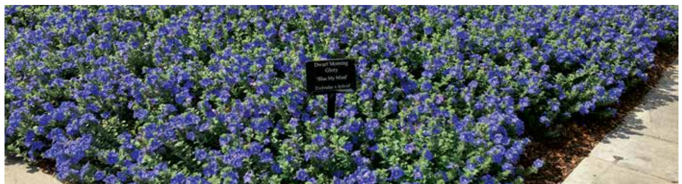
Evolvulus 'Blue My Mind'