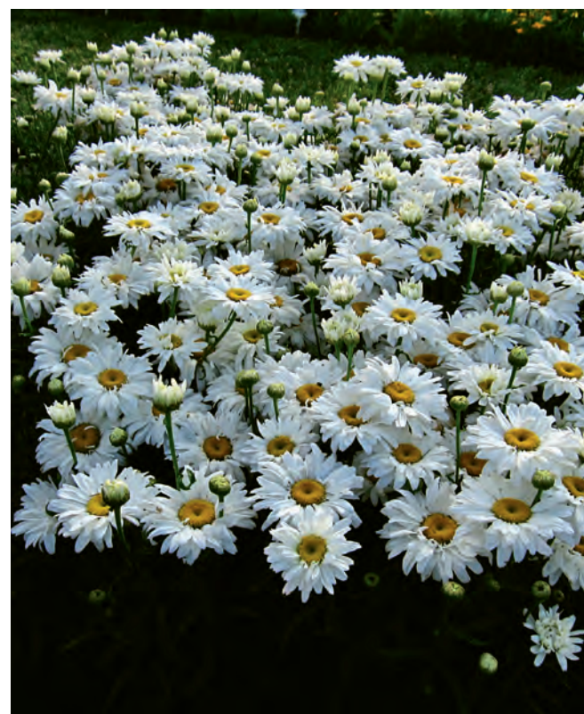
Leucanthemum 'White Magic'