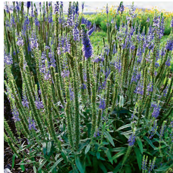
Veronica 'Moody Blues Sky Blue'

canopy. The white and deep rose ray flowers surrounded an orange-brown center cone. These varieties are hardy to Zone 3 and mature to 30-36 inches.