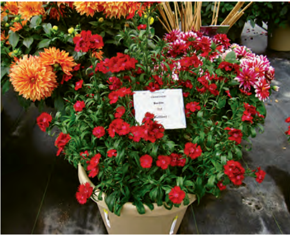
Dianthus 'Rockin' Red'