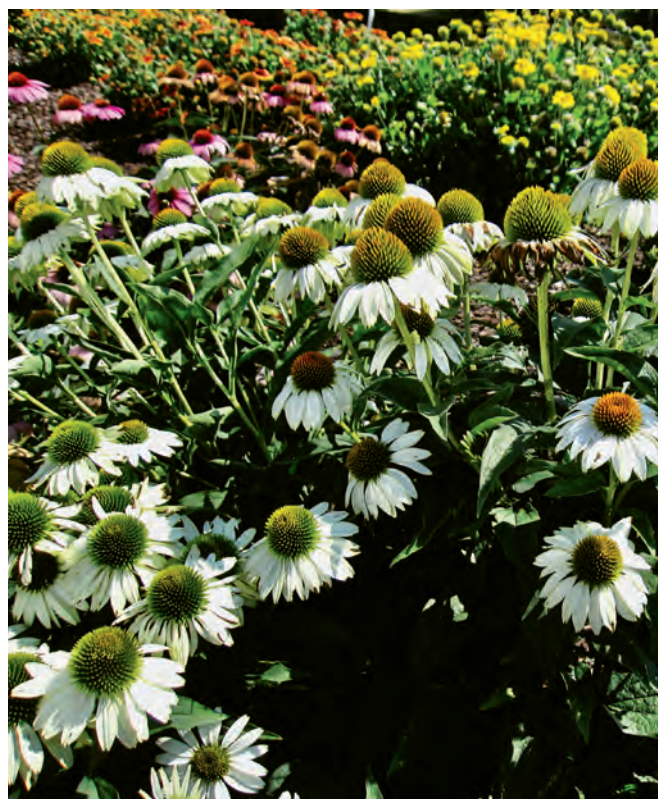
Echinacea 'Primadonna White'