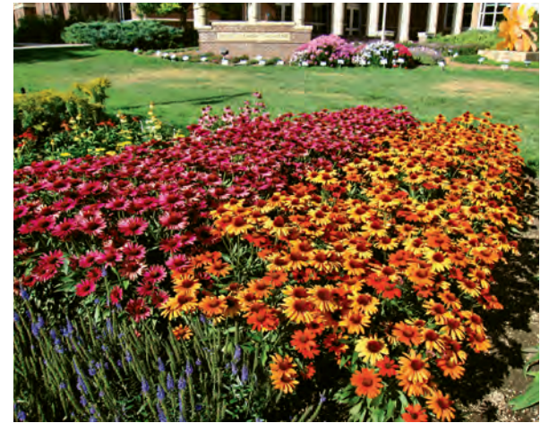
Echinacea Kismet Series

day length neutral. Gold and Bronze has been the most striking color in the series with a large deep bronze eye framed with gold. In my opinion, perennial programs are incomplete without this uniform and floriferous series.