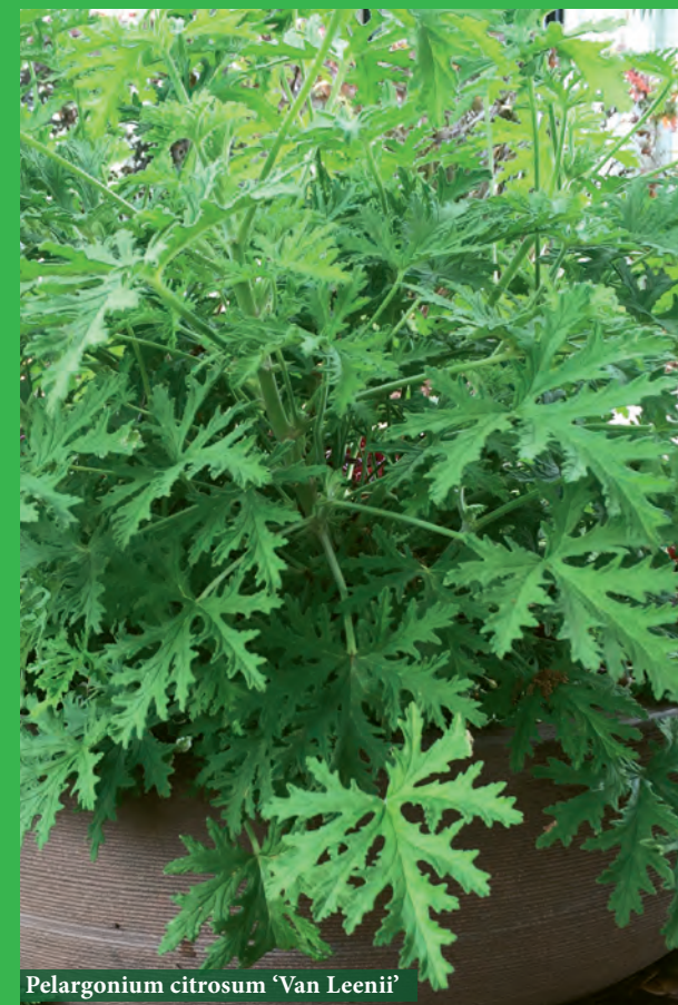
Pelargonium citrosum 'Van Leenii'

19825 State Road 44, Eustis, FL 32736 (352) 589-8055 • www.ag3inc.com