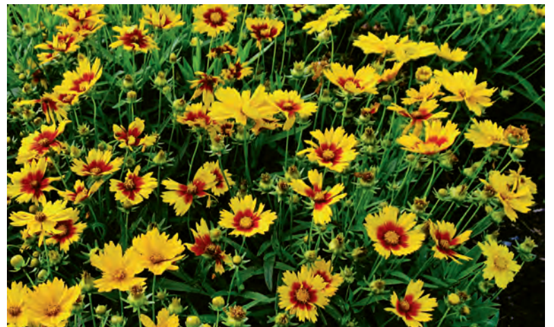
Coreopsis 'Uptick Gold and Bronze'