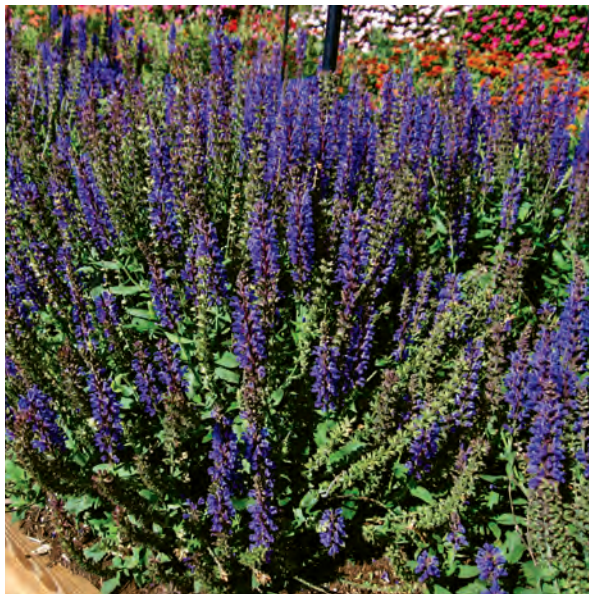
Salvia 'Spring King'