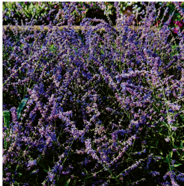
Perovskia 'Crazy Blue'