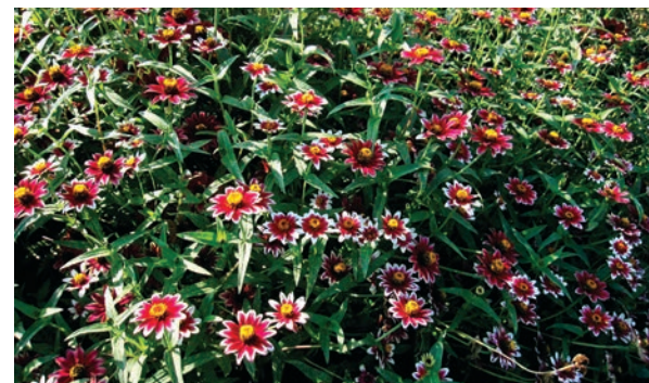
Zinnia 'Zany Rose Picotee'