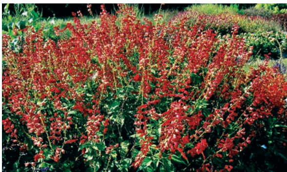
Salvia 'Saucy Red'