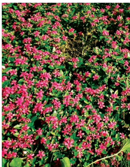
Catharanthus 'Soiree Kawaii Coral'