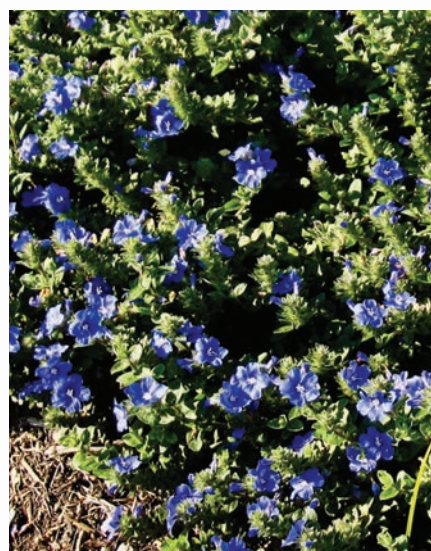
Evolvulus 'Blue My Mind'