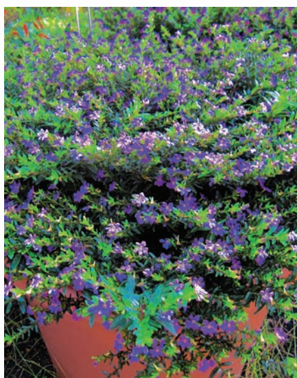
Cuphea 'FloriGlory Sofia'