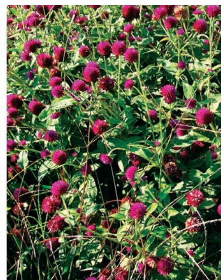
Gomphrena 'Audrey Purple Red'