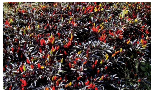
Ornamental pepper 'Midnight Fire'