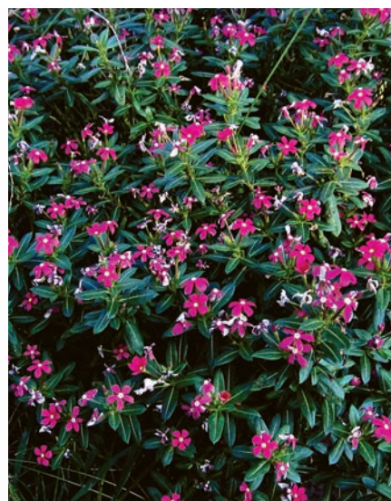
Catharanthus 'Soiree Kawaii Lavender'