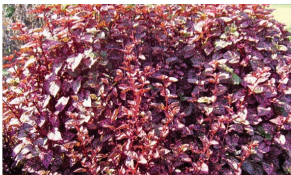
Hypoestes 'Hippo Rose'