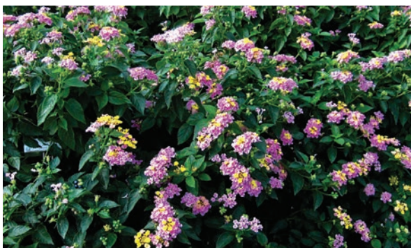
Lantana 'Havana Sunrise'