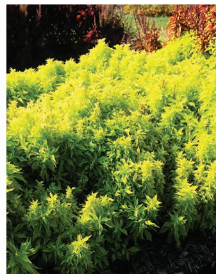
Coleus 'Flamethrower Salsa Verde'