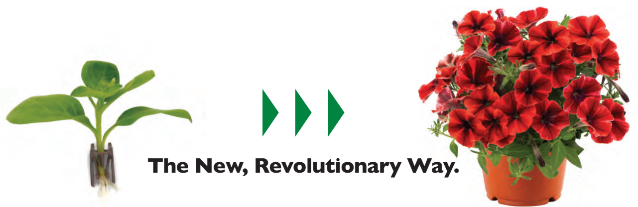
The New, Revolutionary Way.

High quality young plants. Now available from OFFSHORE propagators. Contact Vaughan's Horticulture to order.