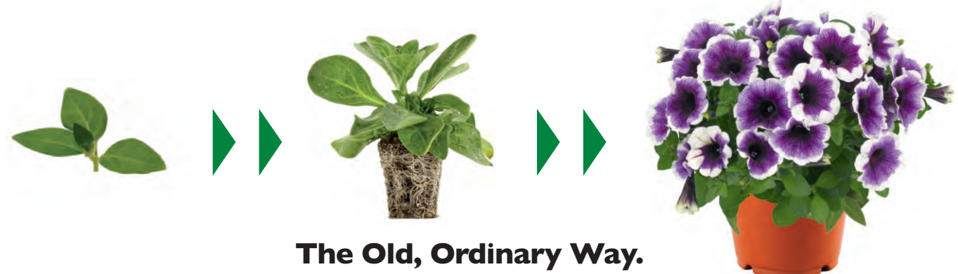
The Old, Ordinary Way.

faster more profitable Two steps are better than three. less expensive smarter