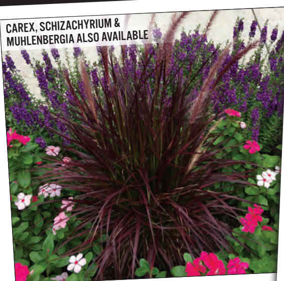
Pennisetum setaceum 'Rubrum'

CAREX, SCHIZACHYRIUM & MUHLENBERGIA ALSO AVAILABLE