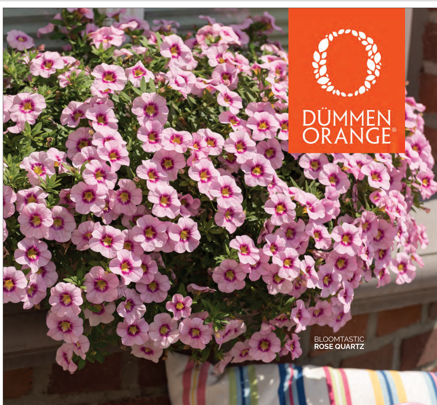
BLOOMTASTIC ROSE QUARTZ

the plants were consistently free flowering and vigorous. The two varieties are extremely heat tolerant, and flower production is so heavy that deadheading is unnecessary. Scarlet is a more traditional gaillardia color, and Yellow is bright and vibrant. Yellow