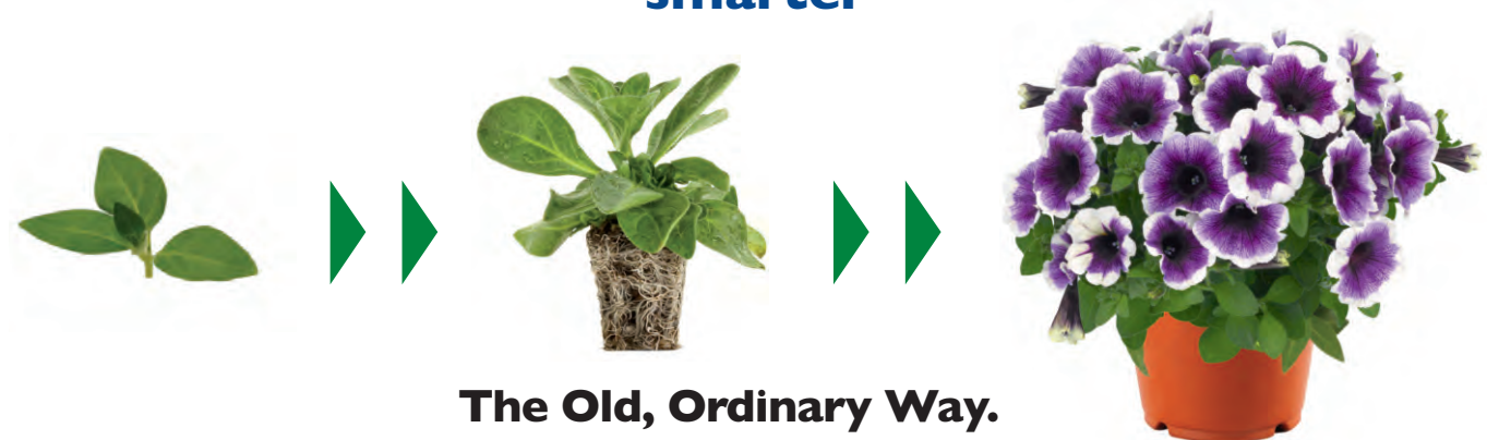
The Old, Ordinary Way.

faster more profitable Two steps are better than three. less expensive smarter