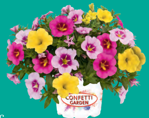
CONFETTI GARDEN SUMMER SOLSTICE

Discover the difference at DummenOrange.com