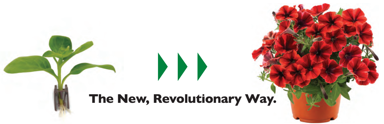
The New, Revolutionary Way.

High quality young plants. Now available from OFFSHORE propagators. Contact Vaughan's Horticulture to order.