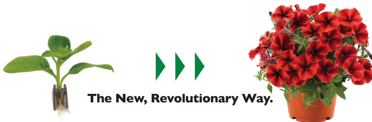
The New, Revolutionary Way.

High quality young plants. Now available from OFFSHORE propagators. Contact Vaughan's Horticulture to order.