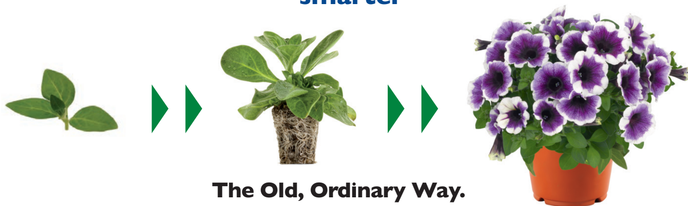
The Old, Ordinary Way.

faster more profitable Two steps are better than three. less expensive smarter