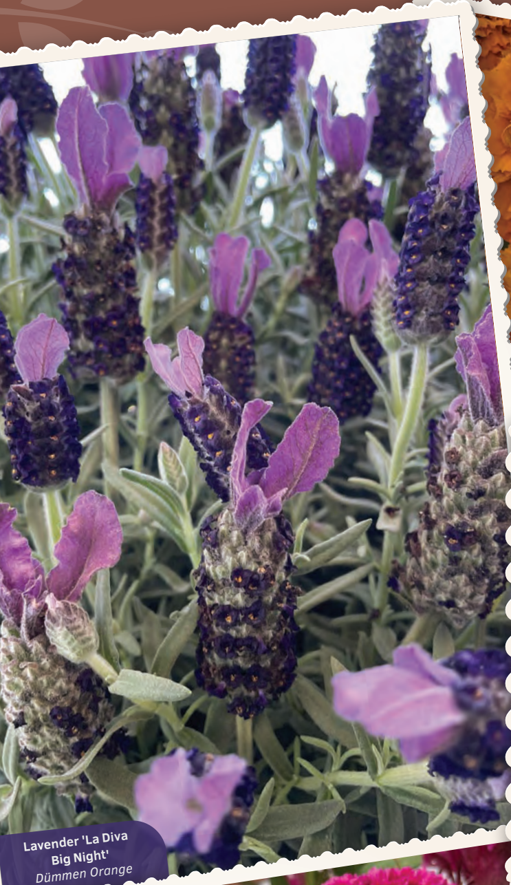
Lavender 'La Diva Big Night' Dümmen Orange

On display at Syngenta Flowers was Think Plants' 'Layla Blue' lavender, which is bred by Danziger , is first-year flowering, requires little to no PGRs and is highly fragrant.