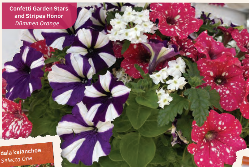
Confetti Garden Stars and Stripes Honor Dümmen Orange