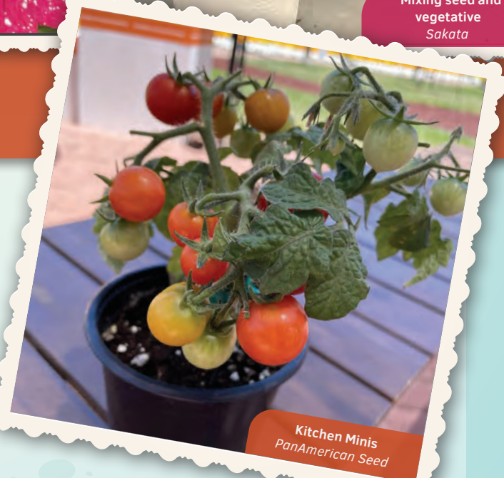
Kitchen Minis PanAmerican Seed

No garden? No problem. PanAmerican Seed's Kitchen Minis program was introduced last year and presents varieties that are ready to place inside on a sunny counter or windowsill. And they'll produce tasty veggies over four to six weeks.