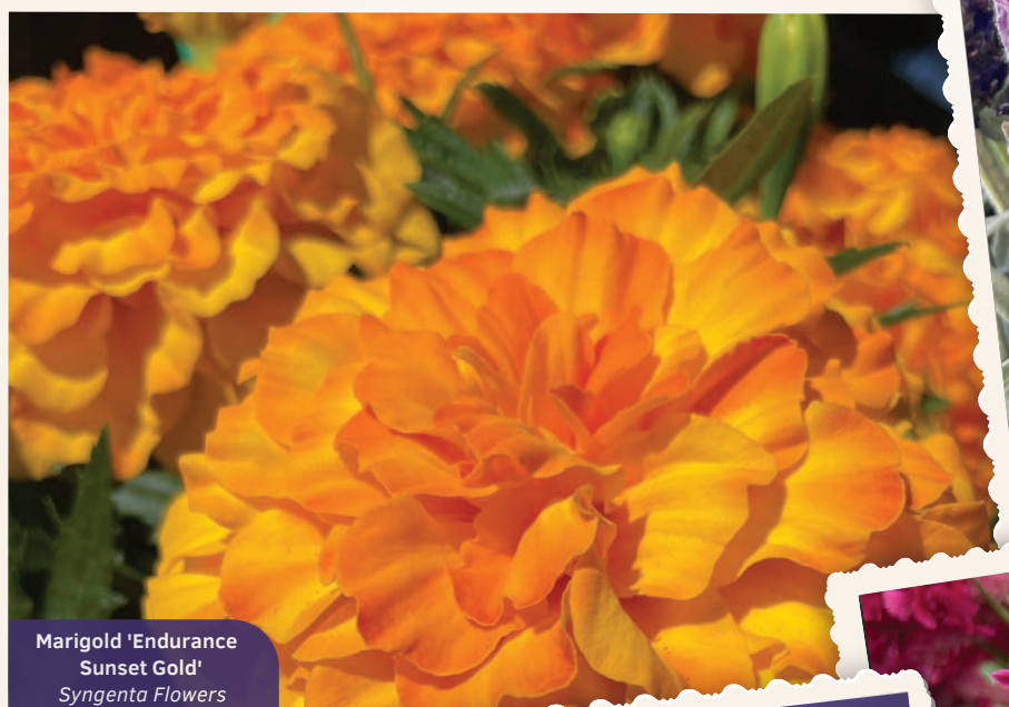
Marigold 'Endurance Sunset Gold' Syngenta Flowers

Stay tuned next month where I dive into all the new variety introductions.