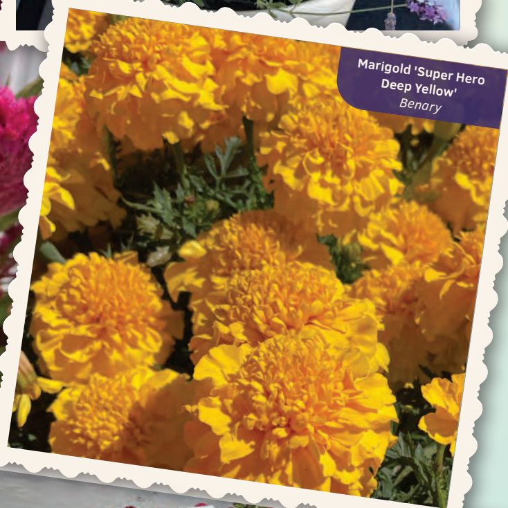
Marigold 'Super Hero Deep Yellow' Benary