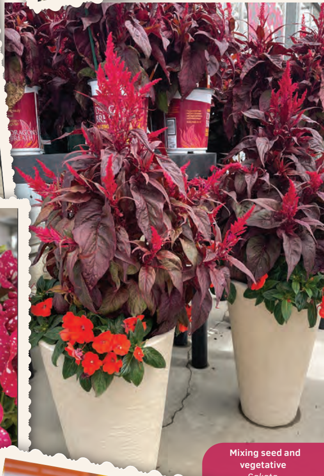
Mixing seed and vegetative Sakata