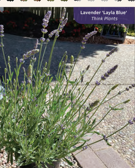
Lavender 'Layla Blue' Think Plants