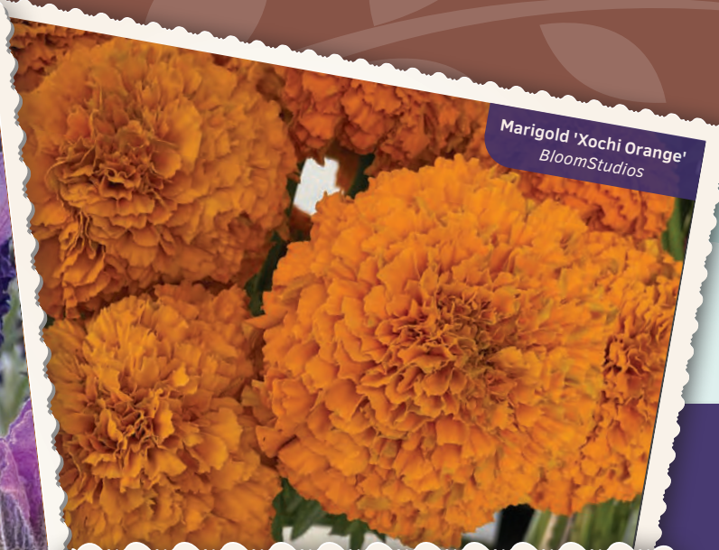
Marigold 'Xochi Orange' BloomStudios