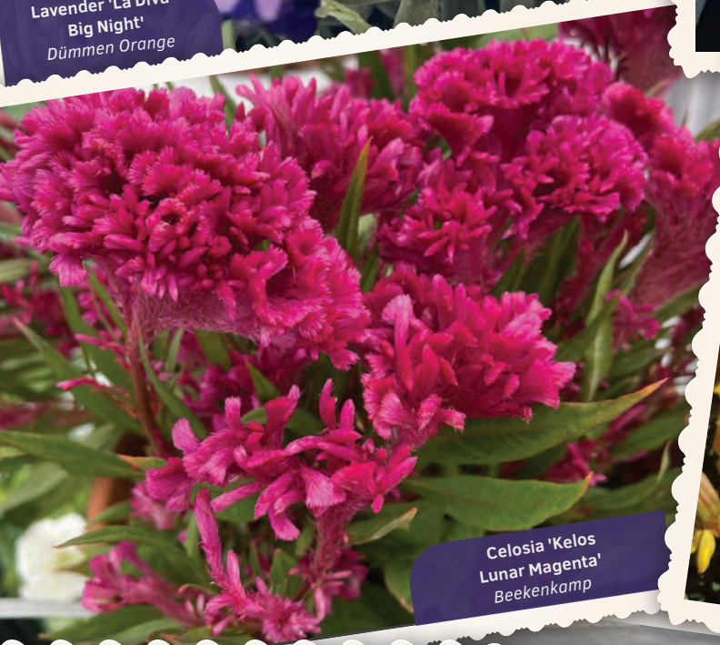
Celosia 'Kelos Lunar Magenta' Beekenkamp