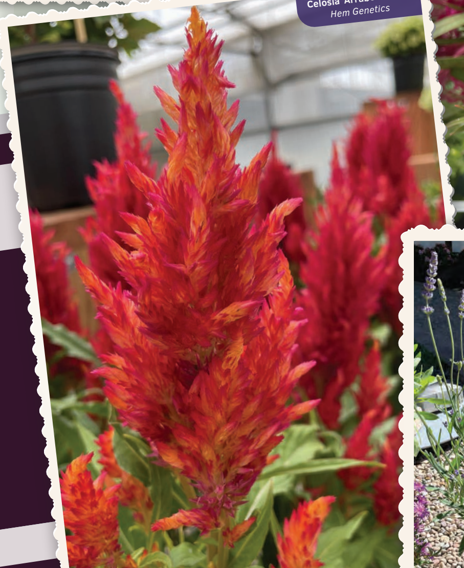
Celosia 'Arrabona Red' Hem Genetics