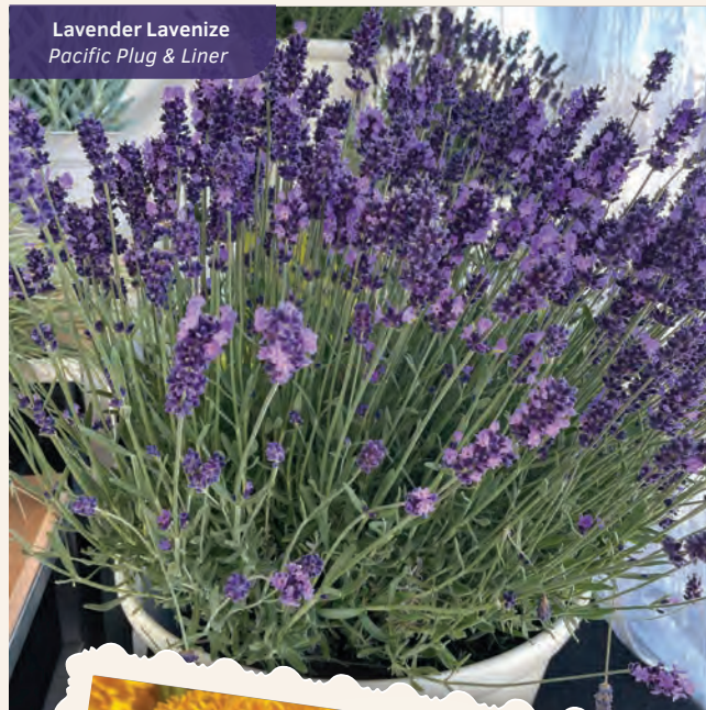
Lavender Lavenize Pacific Plug & Liner