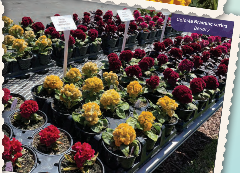
Celosia Brainiac series Benary