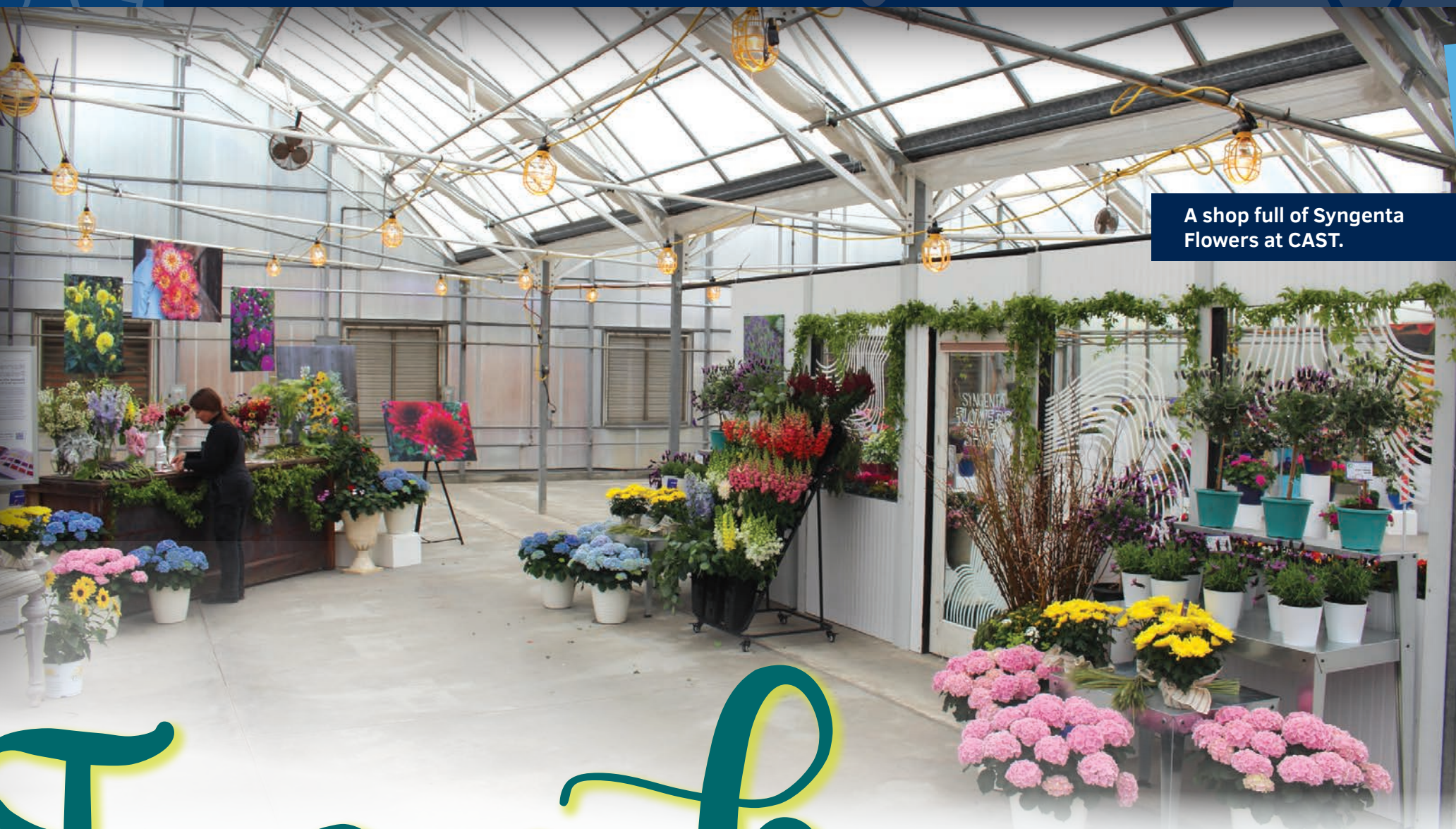
A shop full of Syngenta Flowers at CAST.