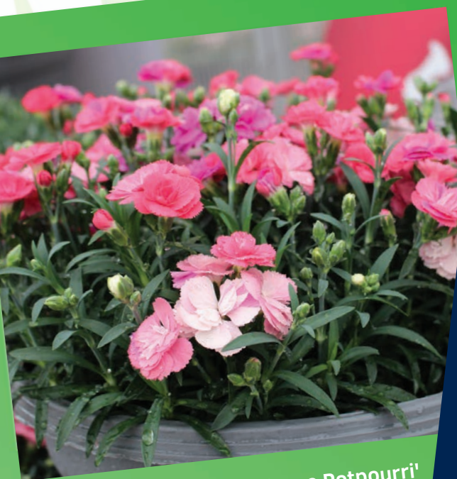
Dianthus 'Constant Cadence Potpourri' Green Fuse Botanicals