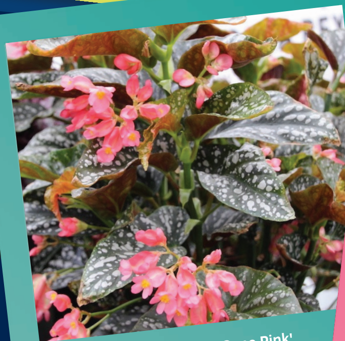
Begonia 'Citizen Cane Pink' Green Fuse Botanicals