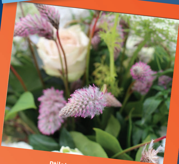
Ptilotus 'Matilda' Benary