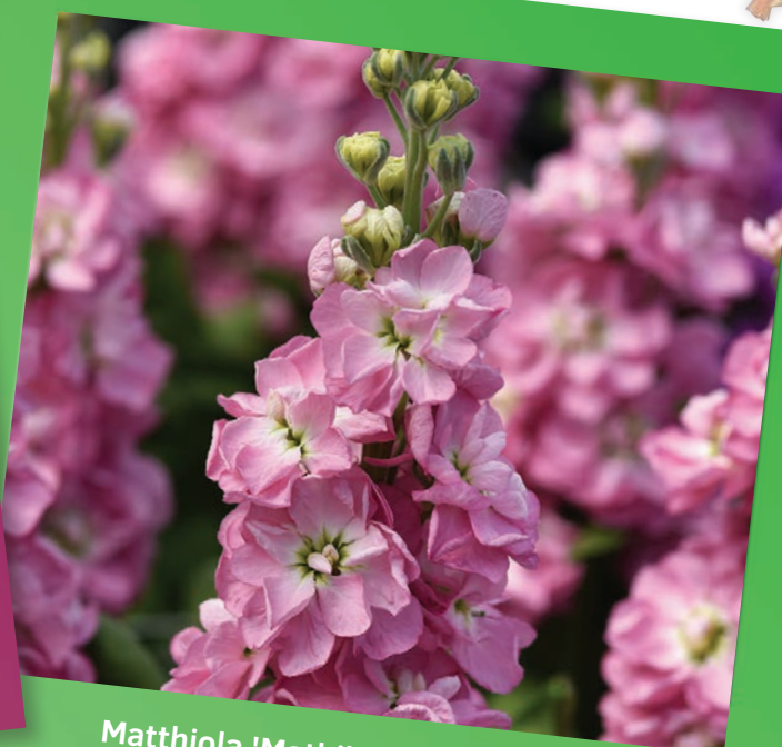
Matthiola 'Mathilda Antique Rose' PanAmerican Seed