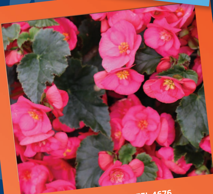
Begonia Dreams BEEL 4676 Beekenkamp

It has dark foliage with a striking leaf pattern and beautiful pink flowers with strong fragrance all growing season. Tight internodes and strong stems make Citizen Cane easy to ship.