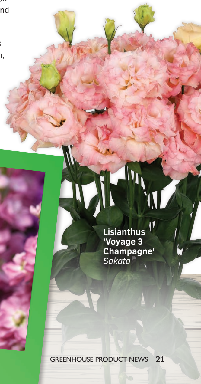
Lisianthus 'Voyage 3 Champagne' Sakata

PanAmerican Seed of the Ball Horticultural Co. debuted a number of new offerings for cut flowers for 2023. Of particular interest was matthiola 'Mathilda Antique Rose', which has been bred for maximum yield and uniform production under moderate temperatures and light levels. Stems are about 25 to 32 inches in length. Harvesting is recommended when three to five florets have opened.