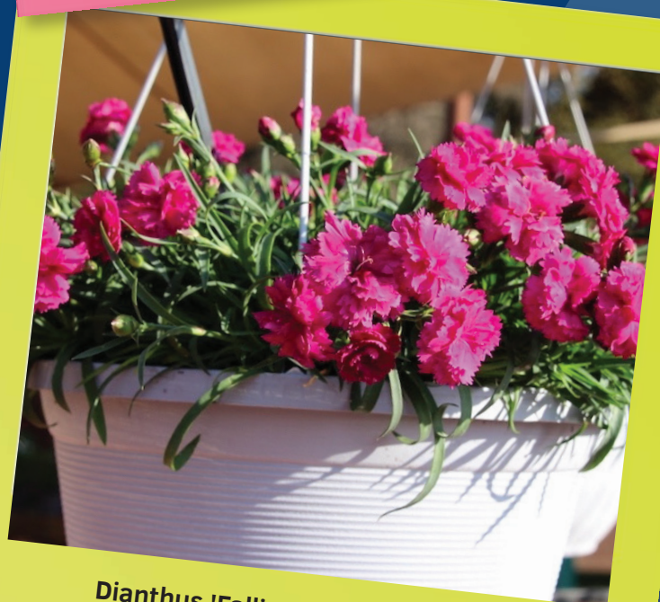
Dianthus 'Falling in Love Rosie' Ball Ingenuity