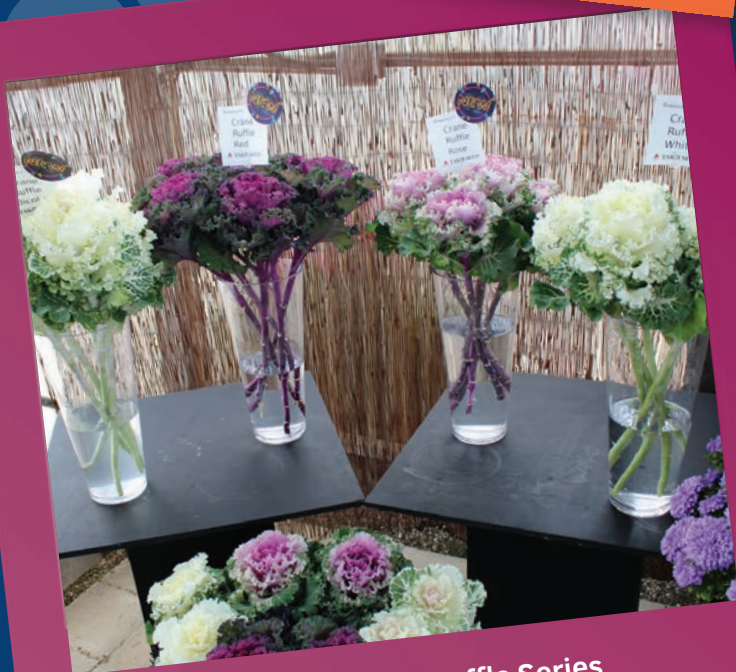
Brassica Crane Ruffle Series Takii Seed