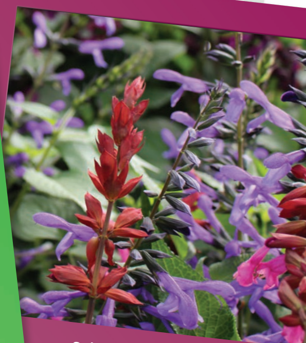
Salvia Salgoon Series HilverdaFlorist