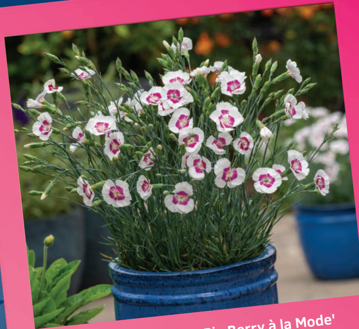
Dianthus 'American Pie Berry à la Mode' PlantHaven

A new hybrid addition to Green Fuse's Lifestyle Collection, 'Citizen Cane Pink' is the first in its series. It excels both indoors and outdoors.