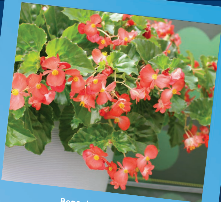
Begonia 'Hula Red' PanAmerican Seed