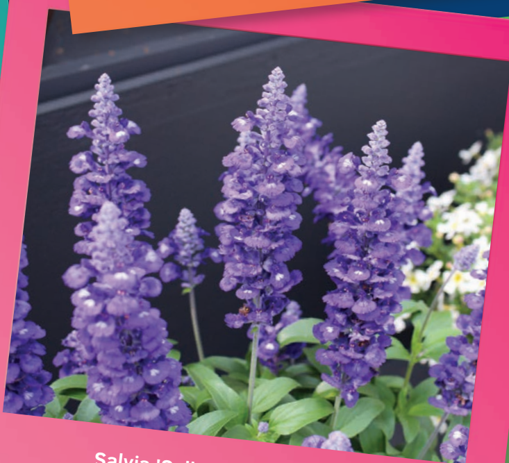
Salvia 'Sallyfun Blue Lagoon' Danziger

HilverdaFlorist's Salgoon series is fast-flowering and vigorous with many side shoots. Plants grow uniformly and have a heavy bloom set. A great garden performer, it is also a hummingbird and bee attractor. Five new colors are available: Lake Garda, Lake Titicaca, Lake Onega, Lake Victoria and Lake Baikal. gpn