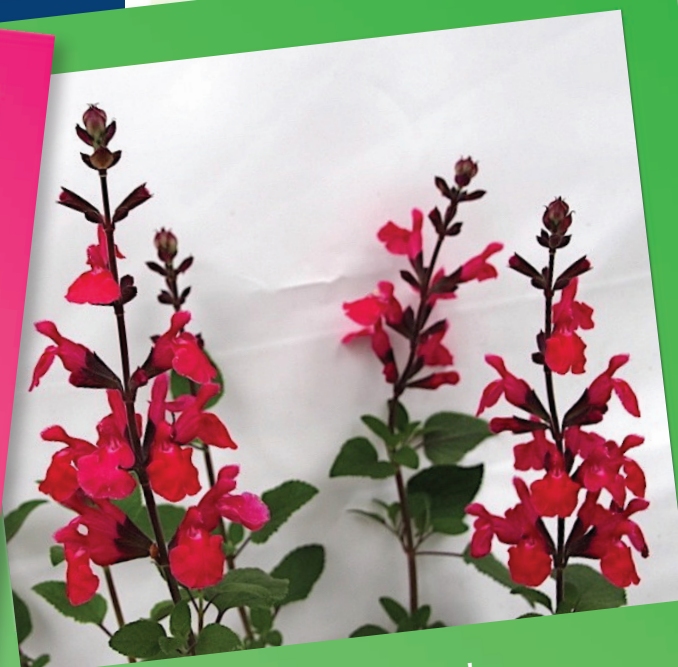
Salvia 'Ping Pong' Jaldety Nursery