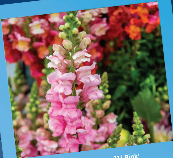
Snapdragon 'Opus III Pink' Syngenta Flowers