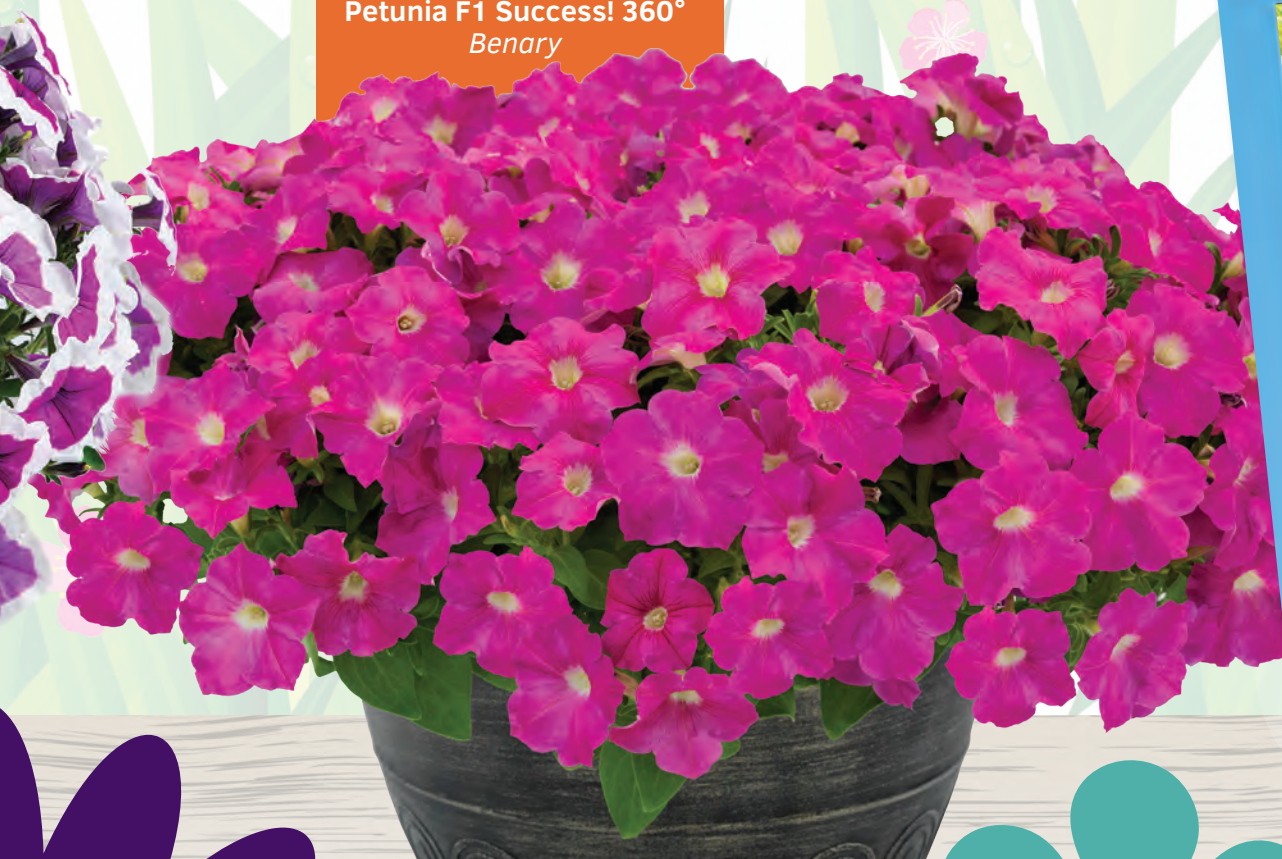
Petunia F1 Success! 360° Benary