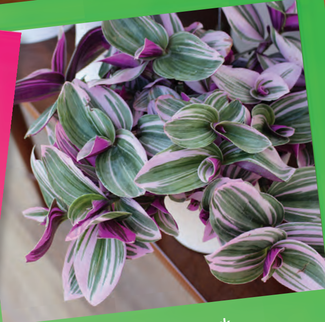
Tradescantia Nanouk Dümmen Orange