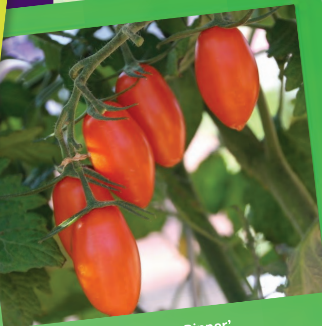
Tomato 'Sun Dipper' PanAmerican Seed