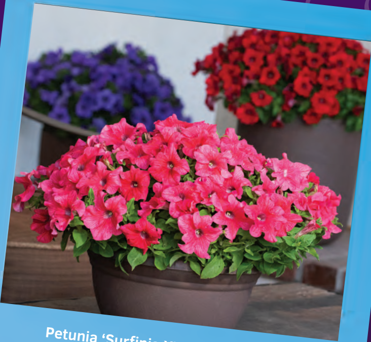
Petunia 'Surfinia XXL Salmon Vein' Suntory Flowers