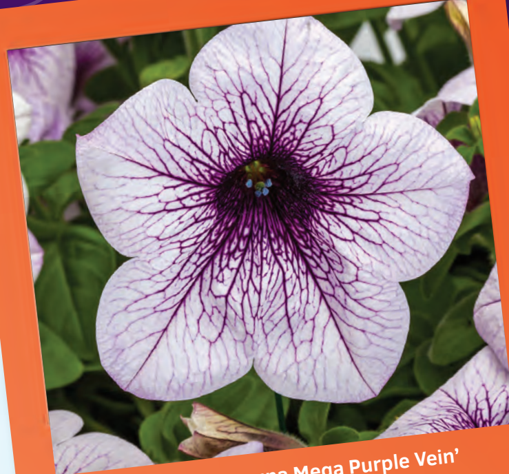
Petunia 'Sanguna Mega Purple Vein' Syngenta Flowers

Ball FloraPlant's new petunia SureShot series has a seven-day flowering time and matching habit, so all colors can be shipped to retail