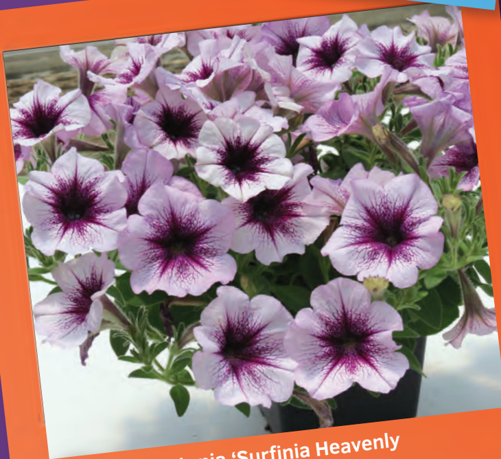
Petunia 'Surfinia Heavenly Amethyst Burst' Suntory Flowers