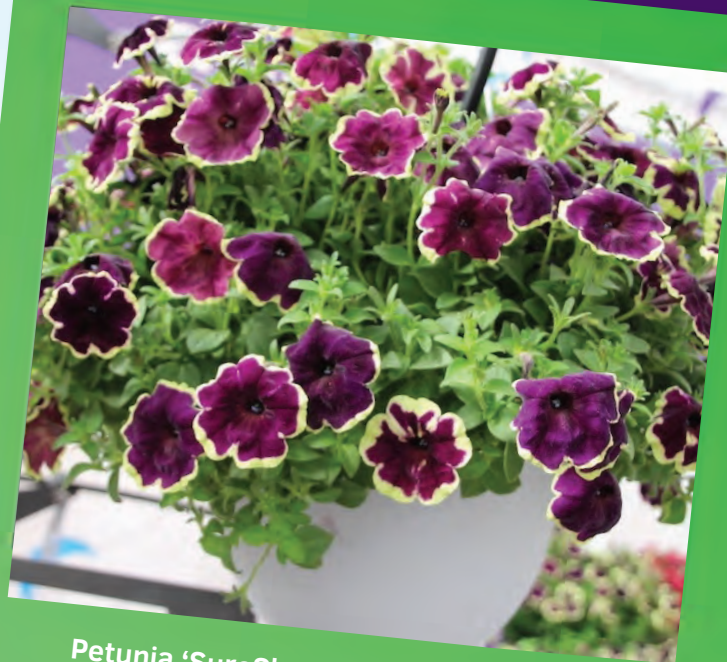
Petunia 'SureShot Blueberries & Cream' Ball FloraPlant