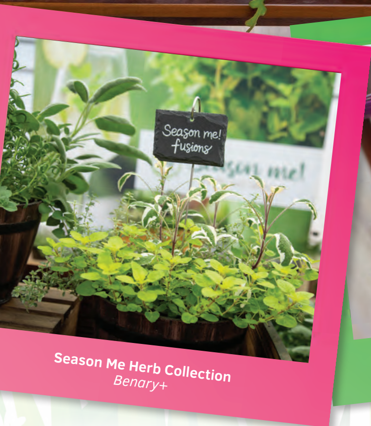
Season Me Herb Collection Benary+