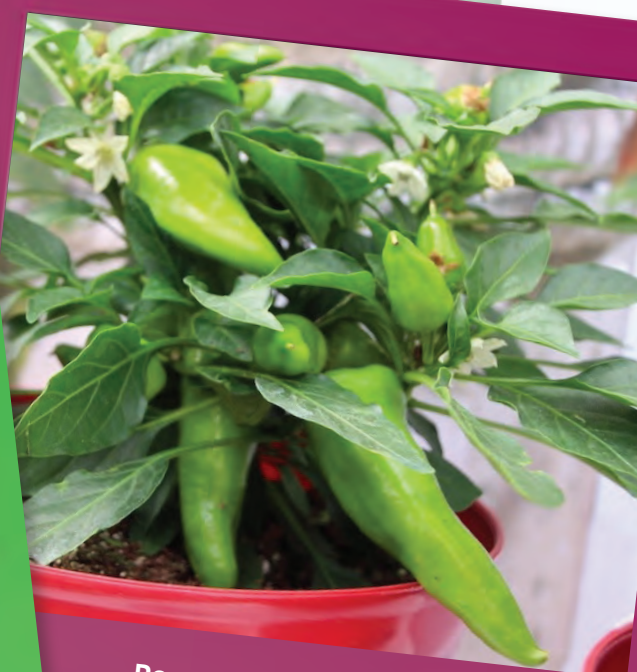
Peppers from Heaven Pure Line Seeds/Prudac

at the same time. All varieties mix well together to create a range of color combinations. It's ideal for all pot sizes and hanging baskets and is available in six colors: Blueberries & Cream (shown), Blue Vein, Dark Blue, Dark Red, Magenta and White.