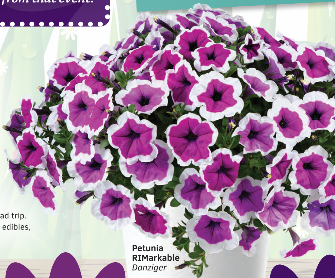
Petunia RIMarkable Danziger

There were some brilliant stand-alone plants, and even new series — such as Sakata's celosia Flamma or delphinium Delgenius from Pacific Plug & Liner — that stood on their own and were well worth consideration. But here are some broader trends from CAST that ran through several of the stops on the road trip. This month, I want to go back to sample the petunias, herbs and edibles, and houseplants that we saw on the West Coast.