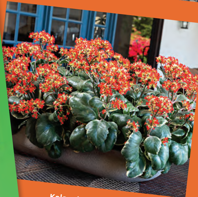
Kalanchoe Bongo Beekenkamp

orange. Suitable to finish indoors on the kitchen table and grown outdoors.