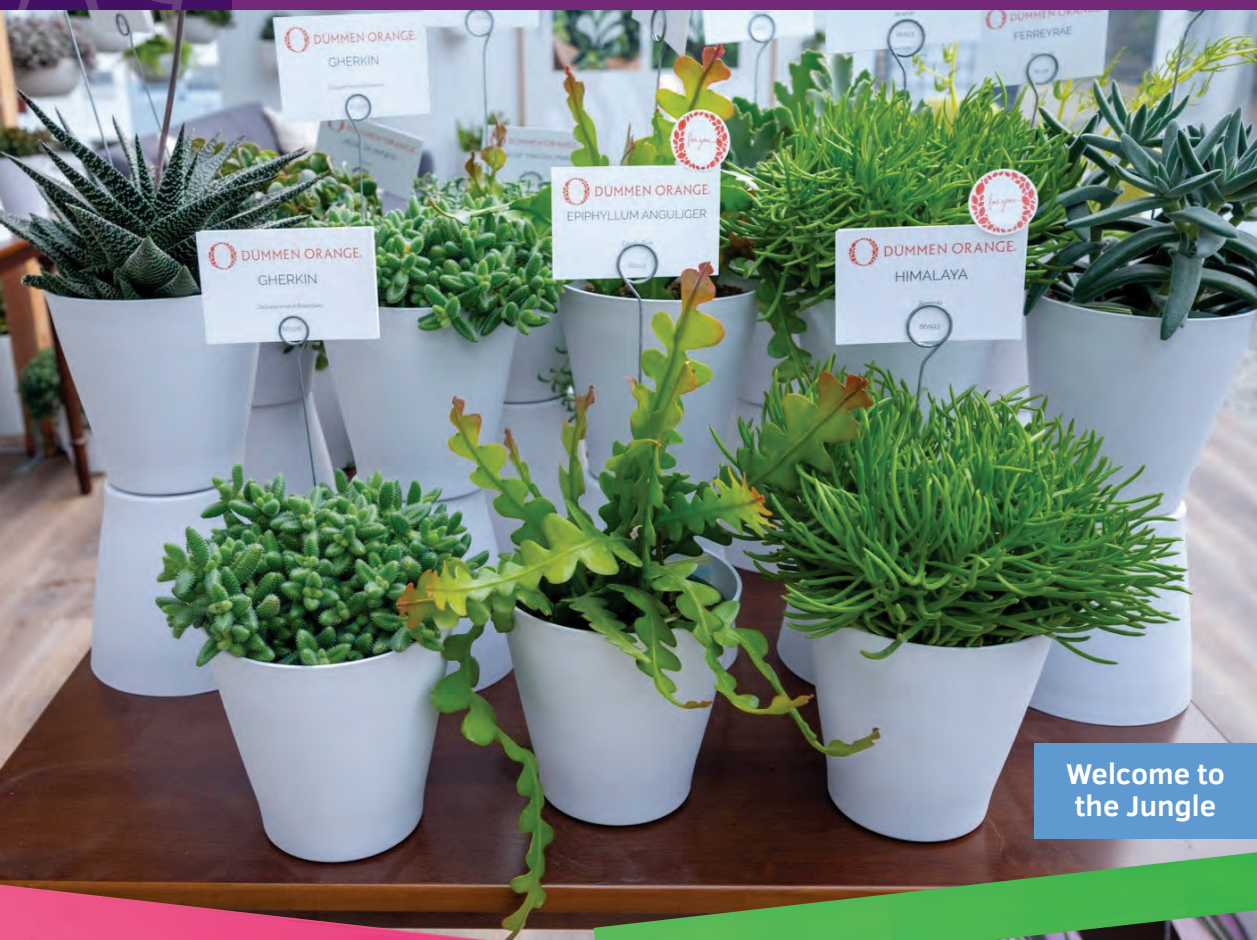
Welcome to the Jungle