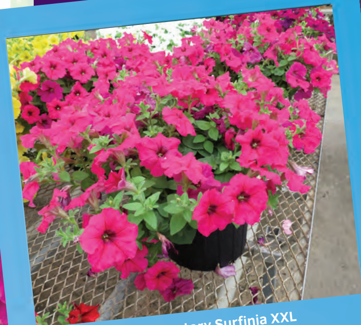
Petunia 'Suntory Surfinia XXL Watermelon Jazz' Suntory Flowers