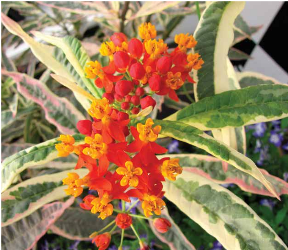
This plant's bright orange-red flowers attract butterflies, bees and hummingbirds

None is recommended. Since this asclepias loves warmer temperatures you will not have to worry