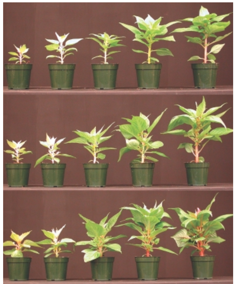
Figure 5. Growth and development of celosia during the finish stage, after 24 days (from transplant of a 288-cell plug) at various temperatures and under different daily light integrals. Average daily light integral from top to bottom: 6 mol·m -2 ·d -1 , 15 mol·m -2 ·d -1 and 21 mol·m -2 ·d -1 . Temperature from left to right: 57, 63, 68, 73 and 79° F.