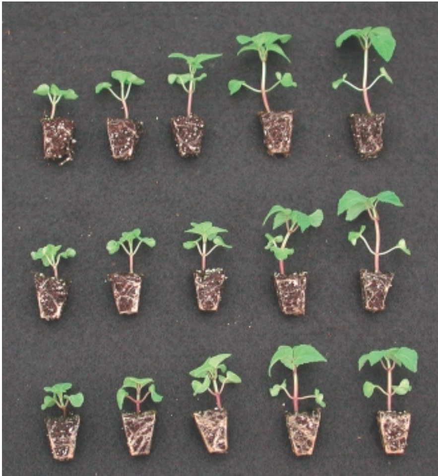
Figure 2. Growth and development of salvia after 22 days at a range of temperatures and under different daily light integrals. Average daily light integral from top to bottom: 6 mol-m -2 -d -1 , 10 mol-m -2 -d -1 and 16 mol-m -2 -d -1 . Temperature from left to right: 57, 63, 68, 73 and 79° F.

ture at which the rate of growth reaches a maximum. Beyond this temperature, the plant's leaf development rate decreases. ◆