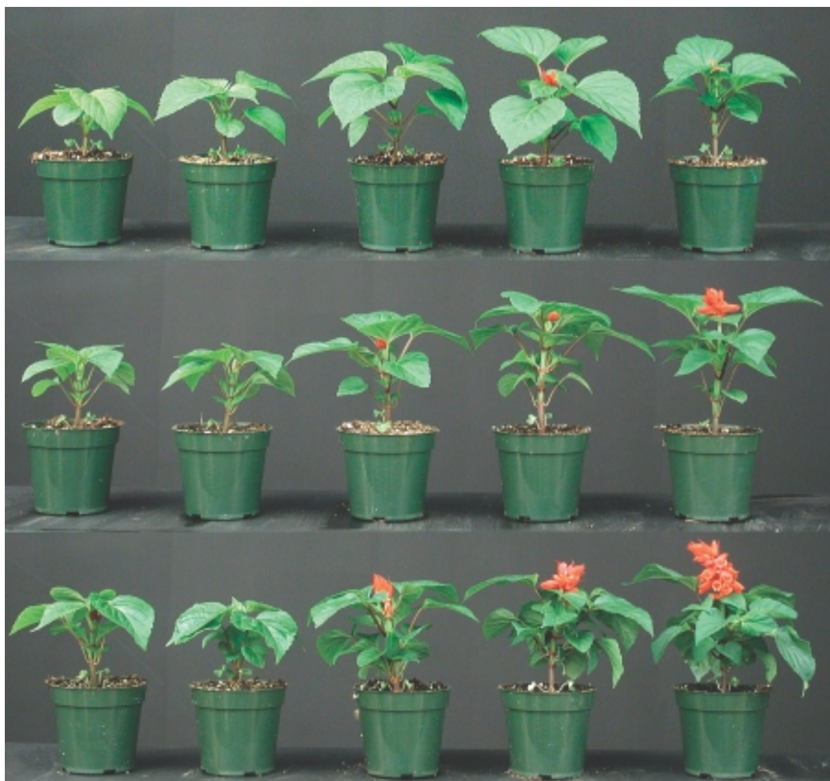
Figure 1. Growth and development of salvia during the finish stage, after 19 days (from transplant of a 288-cell plug) at various temperatures and under different daily light integrals. Average daily light integral from top to bottom: 6 \text{ mol}\cdot\text{m}^{-2}\cdot\text{d}^{-1} , 13 \text{ mol}\cdot\text{m}^{-2}\cdot\text{d}^{-1} and 20 \text{ mol}\cdot\text{m}^{-2}\cdot\text{d}^{-1} . Temperature from left to right: 57, 63, 68, 73 and 79° F.

Fuel prices continue to fluctuate, causing heartburn and headaches for growers as they receive their monthly fuel bills during periods of cold weather. When fuel costs are high, some growers in cold climates (such as the Northern United States) have lowered their greenhouse temperatures to reduce fuel consumption and thus reduce their monthly bill. However, the effect of such a temperature decrease on plant timing and plant quality has not been determined for many popular bedding plant species.