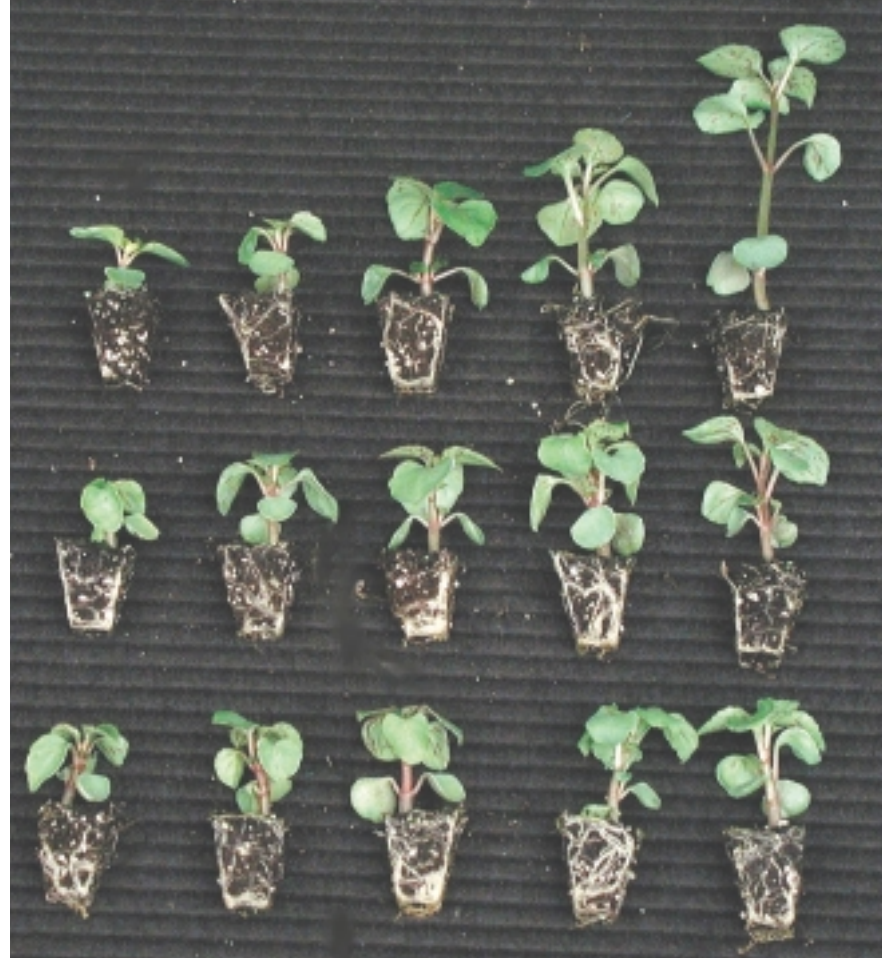
Figure 3. Growth and development of impatiens after 29 days at a range of temperatures and under different daily light integrals. Average daily light integral from top to bottom: 10 mol-m -2 -d -1 , 20 mol-m -2 -d -1 and 24 mol-m -2 -d -1 . Temperature from left to right: 57, 63, 68, 73 and 79° F.