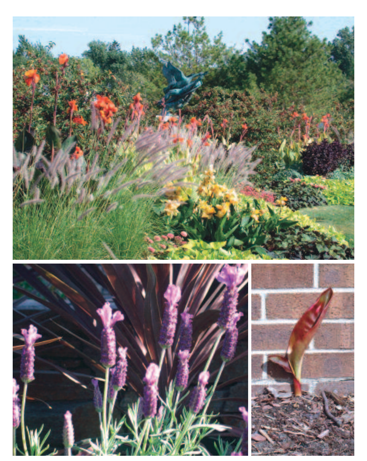
Top: Cannas, grasses, sweet potato vine and more give a tropical look to a Northern garden; bottom left to right: Lavandula in front of Phormiun in a Northern garden.; Brave Canna sprouting overwinters in Zone 5.

Here, we give a handful of tender perennials that have proven to be relatively easy to produce, grow rapidly from seeds or cuttings, and are ornamental enough to make a splash in a container or garden even if they cannot survive the winter.