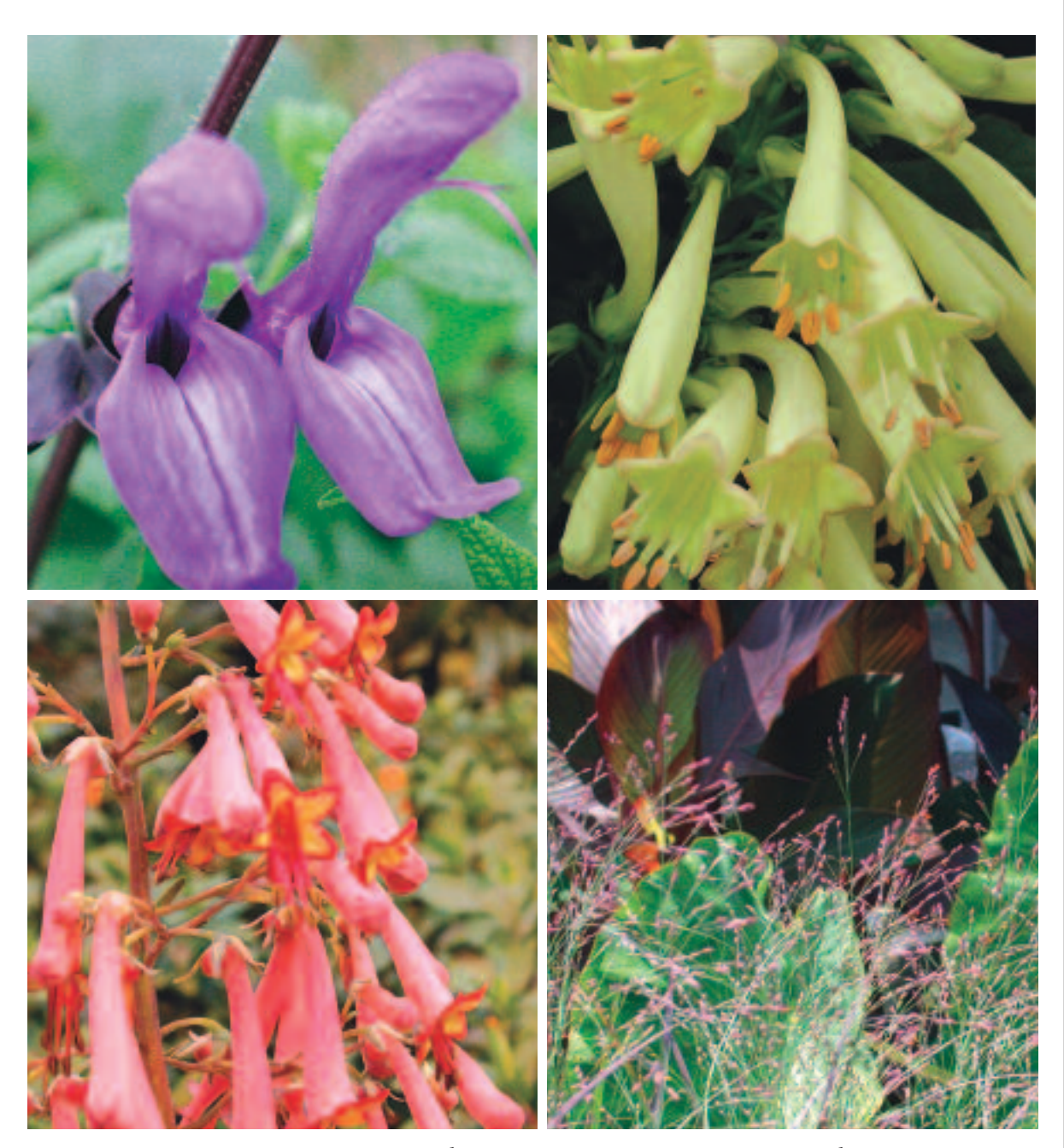
Top, left to right: Salvia 'Black and Blue'; Yellow Phygelius aequalis; bottom, left to right: Red Phygelius sp.; Panicum virgatum 'Shenandoah'.

reduce the problem. Overgrown floppy plants are not only difficult to treat with chemicals; they are a pain to ship. Overall, it is best to market short plants with flowers. Indeed it is the intensely dark blue flowers that are of ornamental interest. After a recent plant sale, we observed that the only Black and Blue plants remaining were those with no flowers. Photos can never substitute for the real thing.