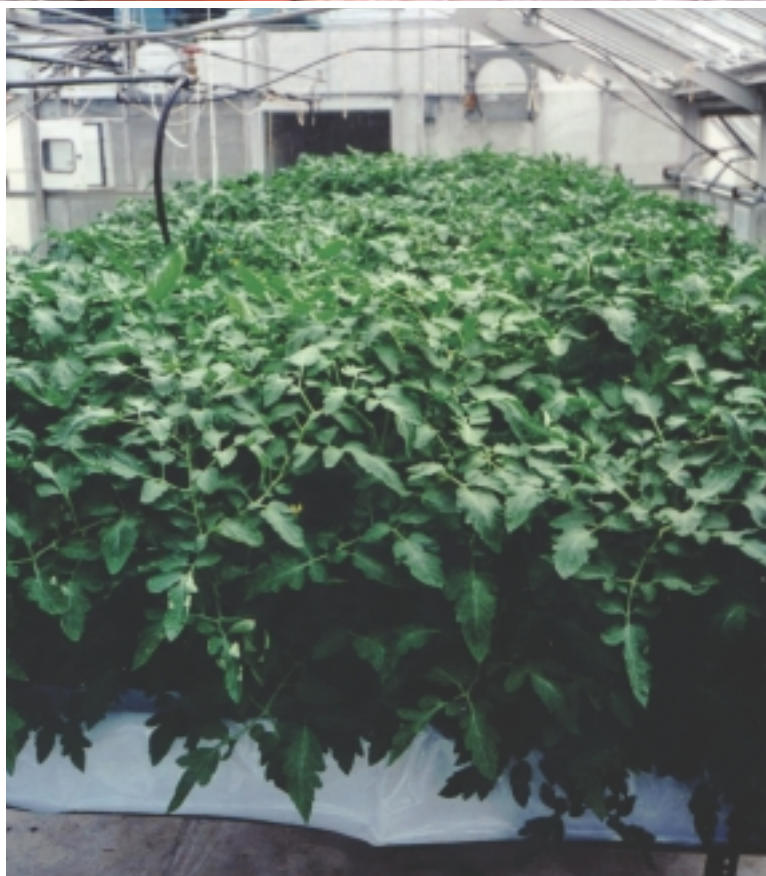
Top: Properly grown hydroponic tomatoes are often fit to be framed; Bottom: This single-truss crop is being grown on greenhouse benches in NFT.

Lists of recommended tomato varieties for hydroponic production tend to rapidly go out of date. However, there are a few