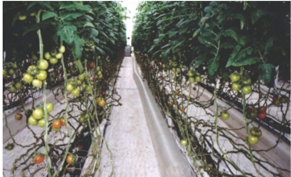
Long-term tomato crops are frequently lowered and layered.

There are numerous reports from all over the