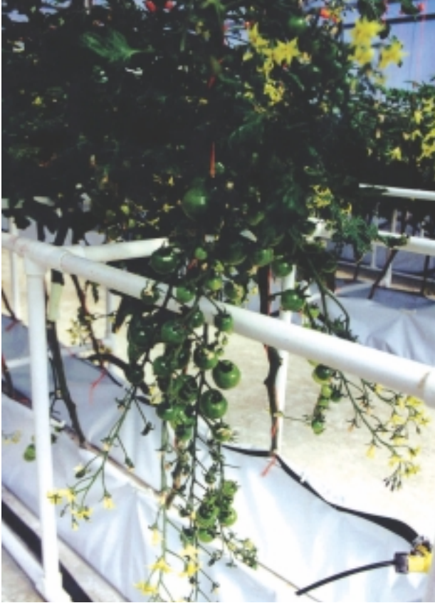
Cocktail tomatoes are popular in some markets.

and management system than nonrecirculating systems. Recirculating systems tend to start off with a well balanced nutrient formula that features plenty of each element for plant uptake. However, by the time the solution has passed through the root systems of the plants, certain nutrients may have been taken out more than others, causing imbalances in the nutrient solution that are unknown to the grower. As the EC is adjusted each day with more stock solution and additional water, some of the nutrients under heavy demand are replaced — but sometimes not to sufficient levels. One example is potassium. In recirculating systems where tomato plants are carrying a heavy crop load, potassium can be depleted within a few days despite frequent additions of concentrated nutrient stock solutions.