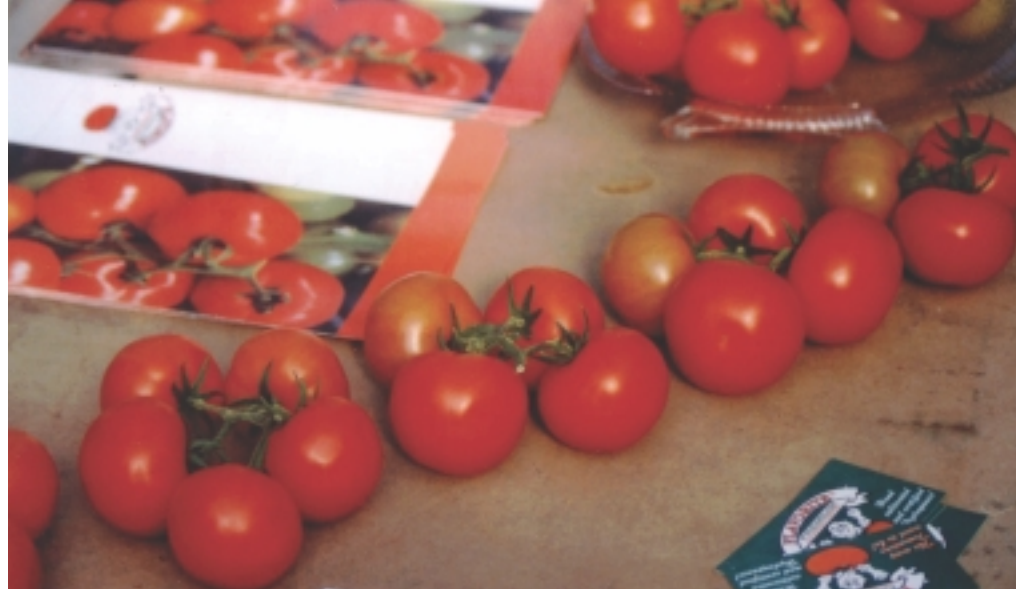
Cluster tomatoes are popular in many high-end markets.

with a higher percentage dry matter, sugar and acid and, consequently, better taste and firmness. This has been found to be the case with both large-fruited and cherry tomatoes. It has been found that both sugars and acidity levels increased in the cherry cultivar Gardeners Delight with fruit grown at an EC of 10 mS/cm -1 as compared to an EC of 2.5 mS/cm -1 . Other studies have reported that the dry matter content, sodium content and acidity of fruit grown at an EC of 8 mS/cm -1 was greater than fruit grown at 3 mS/cm -1 .