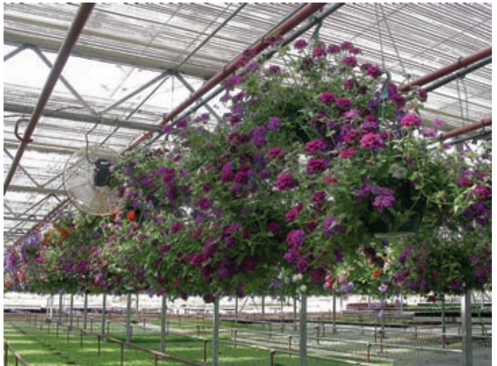
Verbenas' innate vigor helps protect them against some diseases that require a debilitated host.

New research from Michigan State and Cornell identifies which verbenas varieties are resistant to powdery mildew.