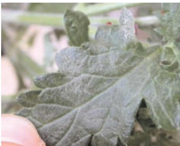
Powdery mildew colonies may develop on the upper leaf surface.

Verbenas have a key position among bedding, hanging basket and container crops. They provide pure, bright colors or delicate, pastel shades and generally grow like gangbusters. This innate vigor protects them from some of the disease problems that require a debilitated host. Yet, there is one pathogen group that takes advantage of perfectly healthy plants, those that are not stressed in any way: the powdery mildews (PM). Because PM caused by Podosphaera xanthii has been especially troublesome to manage on verbenas in recent years, we have focused on it in an American Floral Endowment-funded research project that aims to improve PM management for ornamentals.