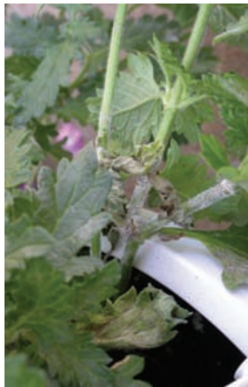
PM may develop on stems as well as verbena leaves.

encountered infection until after several months of field cultivation.